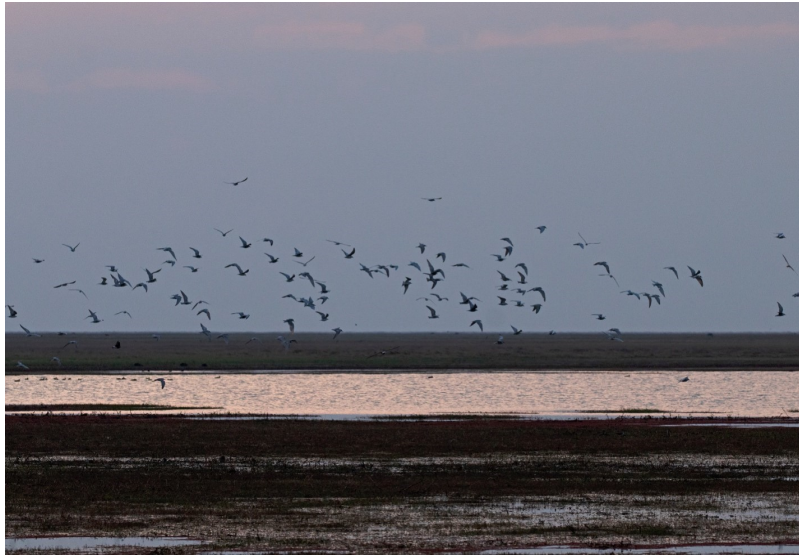
Fig. 2. Part of the large flock of Whiskered Terns gathering to roost at a pan in Liuwa Plain National Park, Zambia, on 24 July 2021.

Barotse Floodplain and Kafue Flats (Dowsett et al. 2008). Large numbers have been reported from these areas, including counts of over 1,000 terns (BirdLife and Wetlands International 2022; F. Willems, pers. comm.). Generally, however, counts are cumulative for an entire area or survey day, so there are no details on group or roost sizes. Here we report Whiskered Terns forming large nocturnal roosts in a national park and dispersing during the day, including one of the largest recorded concentrations of the species from south-central Africa.