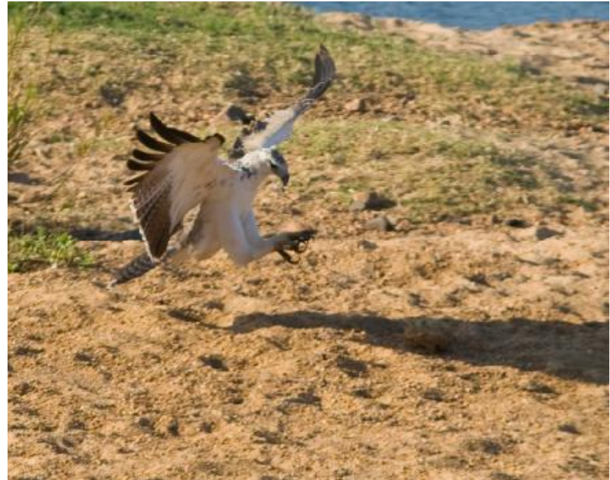
Figure 1 - The immature Martial Eagle about to capture its play object – a bolus of elephant dung.

view. The bird then took off and flew about 20 m before extending its legs and talons and “striking” a bolus of elephant dung (Figure 1).