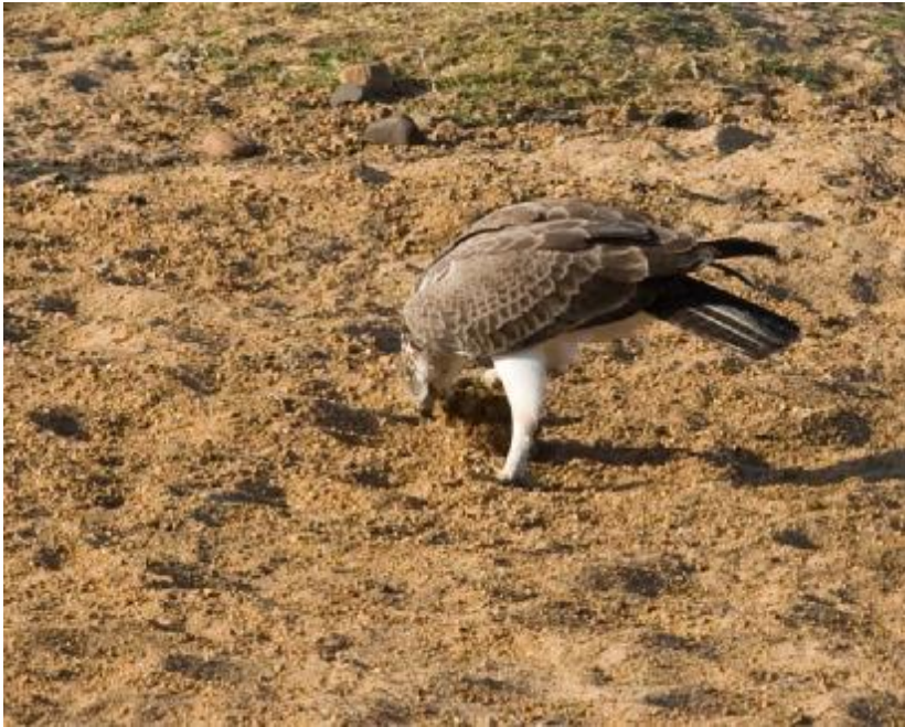
Figure 4 – It proceeded to rip pieces off from the dung bolus as if pretending to eat it.

note of the age of the bird, the type of play (e.g. object, locomotory or social) the bird engages in, the time of the day, the age of the bird, the presence of other individuals of the same species, the duration of play (or the duration of the observation) and the size and type of the object involved in play.