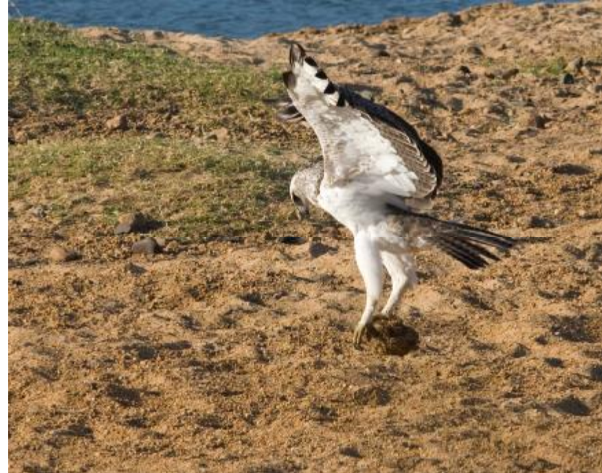
Figure 3 – Taking off with its play object.

items of Martial Eagles, e.g. hares (Leporidae), Helmeted Guinea-fowl (Numididae), francolins and spurfowls (Phasianidae).