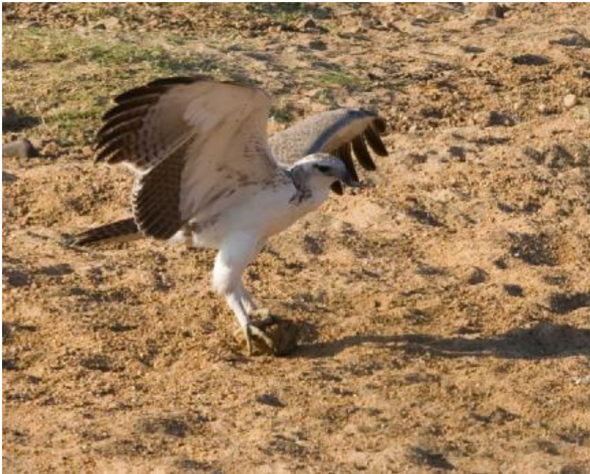
Figure 2 – It remained perched on its “prey” for a few seconds.

The total duration of the play was approximately 13 minutes. In one of the attempts, the bird also performed a “mantling-display” after catching the dung bolus by spreading its wings over it. At no stage was an adult bird observed in the vicinity of the immature bird. The behaviour observed was clearly an example of object play aimed at improving various motor skills associated with catching and manipulating prey.