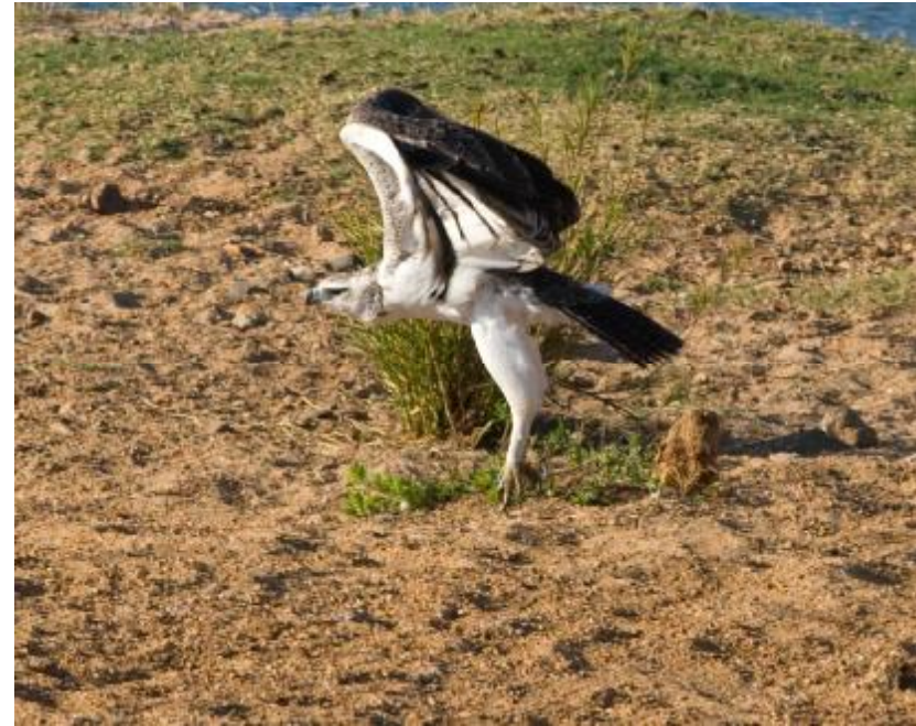
Figure 5 – The bird repeatedly took off with its “prey” but dropping it shortly thereafter.