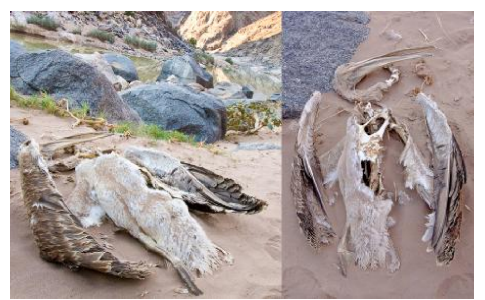
Figure 2: Great White Pelican carcass found 2 June 2010 in the Fish River Canyon

and end up in the Fish River Canyon. Atlas data does indicate Great White Pelican records on the Fish River 220 km north of the Fish River Canyon sightings.