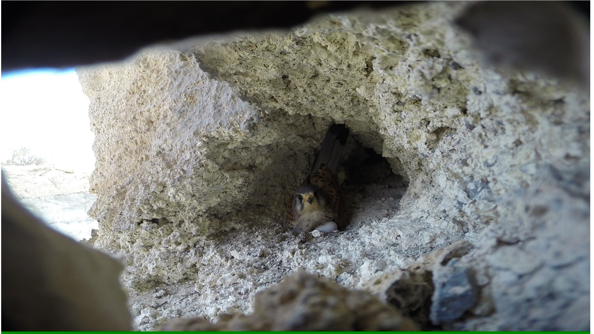
Figure 3: Male kestrel incubating the feral pigeon's Columba livia eggs.