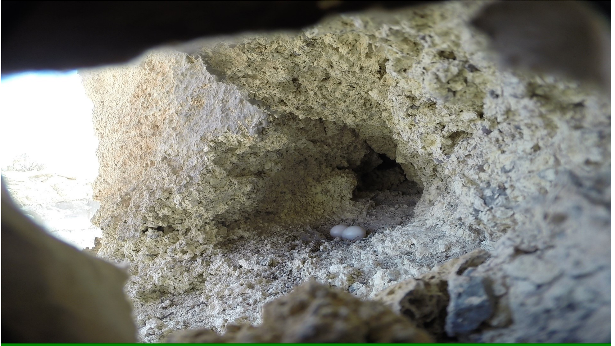
Figure 1: Nesting rocky cavity with the feral pigeon's Columba livia usual clutch of two eggs which was incubated by kestrels Falco tinnunculus .