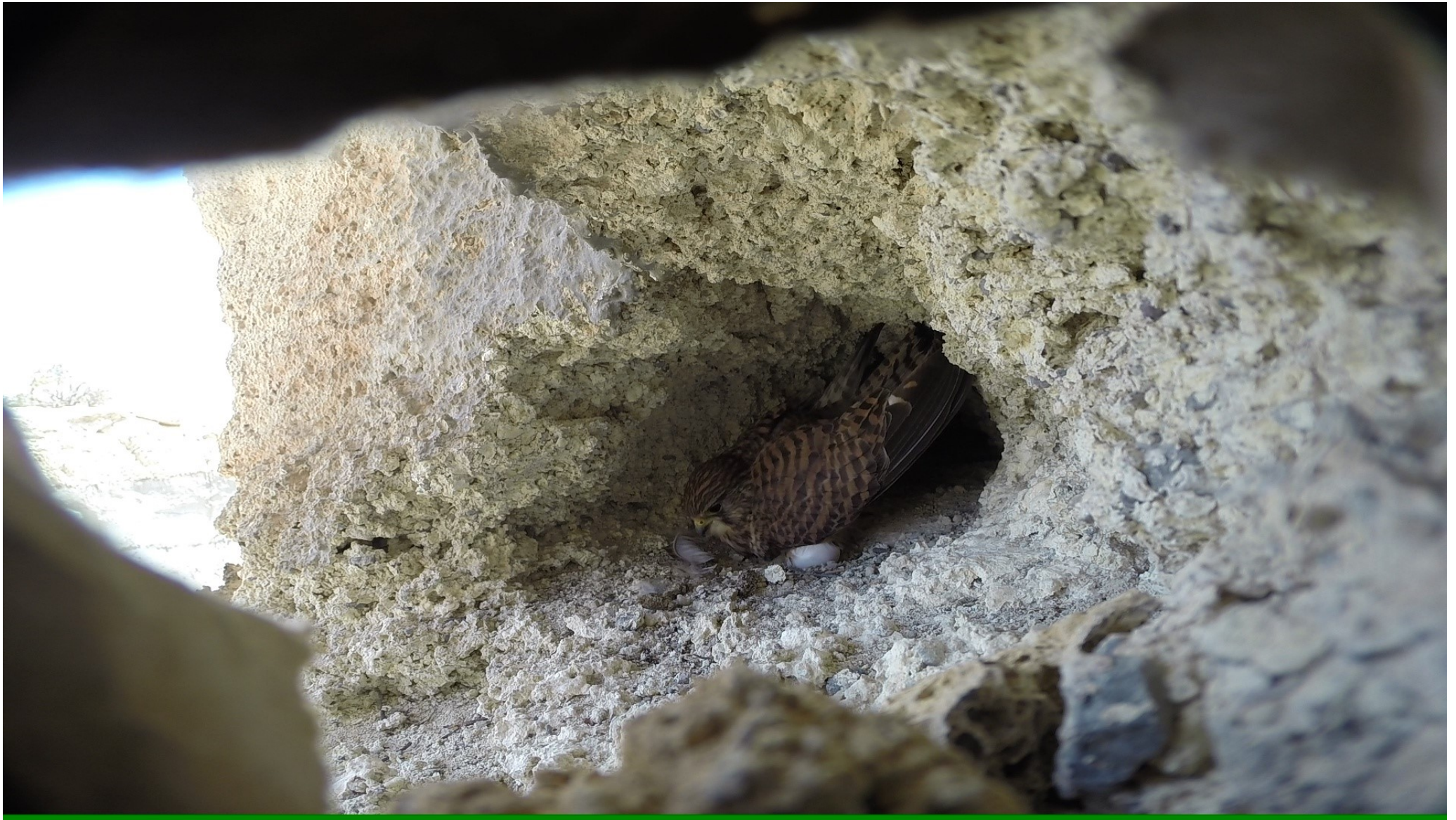
Figure 2: Female kestrel incubating the feral pigeon's Columba livia eggs.