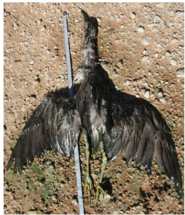
Figure 8 – Showing total length