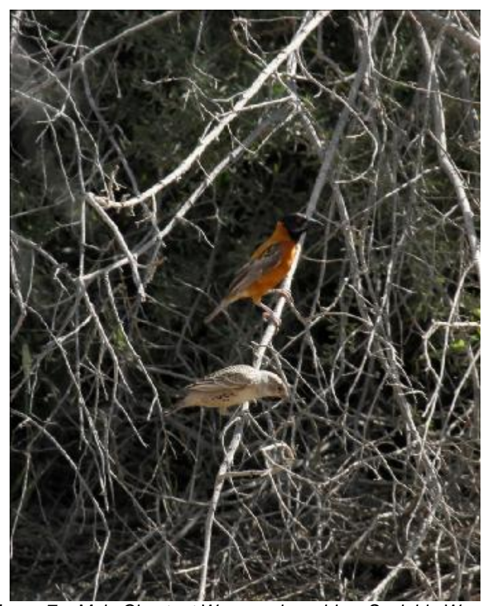
Figure 7 – Male Chestnut Weaver alongside a Sociable Weaver