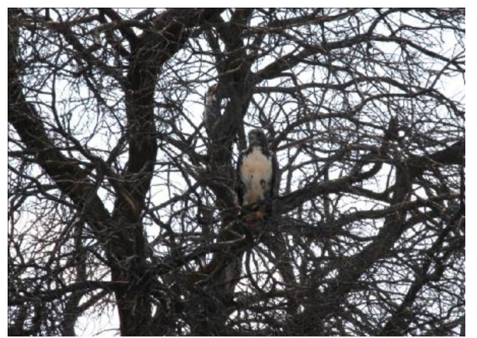
Figure 4 – Jackal Buzzard displaying an all-white breast

Probably the sighting of the season in the south of the park was a male Chestnut Weaver Ploceus rubiginosus . It appeared at Samevloeiing waterhole in full breeding plumage on 12 April 2011. I was fortunate enough to get a couple of pictures of this bird (Figure 7). The bird was in a large group of birds congregating in small bushes in the flooded surrounds of the actual waterhole.