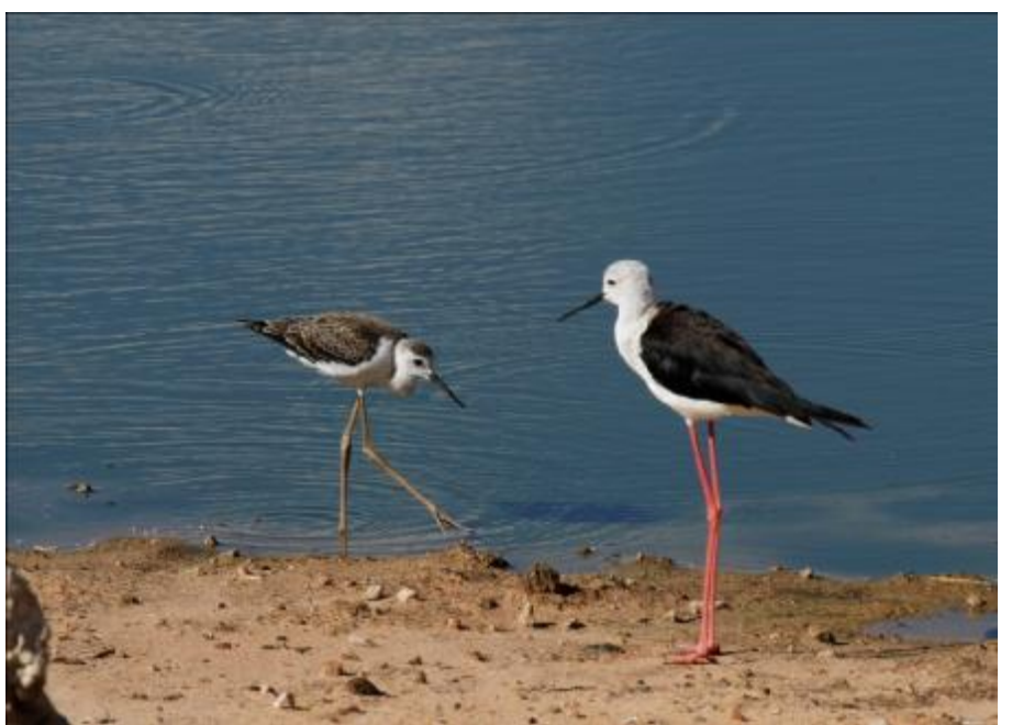
Figure 5 – Black-winged Stilt with chick at Samevloeiing waterhole

Extensive efforts were made in the proceeding days to re-locate it, but we were unable to find the bird again. Two previous sightings of the Chestnut Weaver were reported in January 2011. Whittington (2011) reported a sighting from Nossob Rest Camp and a week later another sighting was reported from Tswalu Private Nature Reserve. It is likely that these three sightings may be of the same bird.