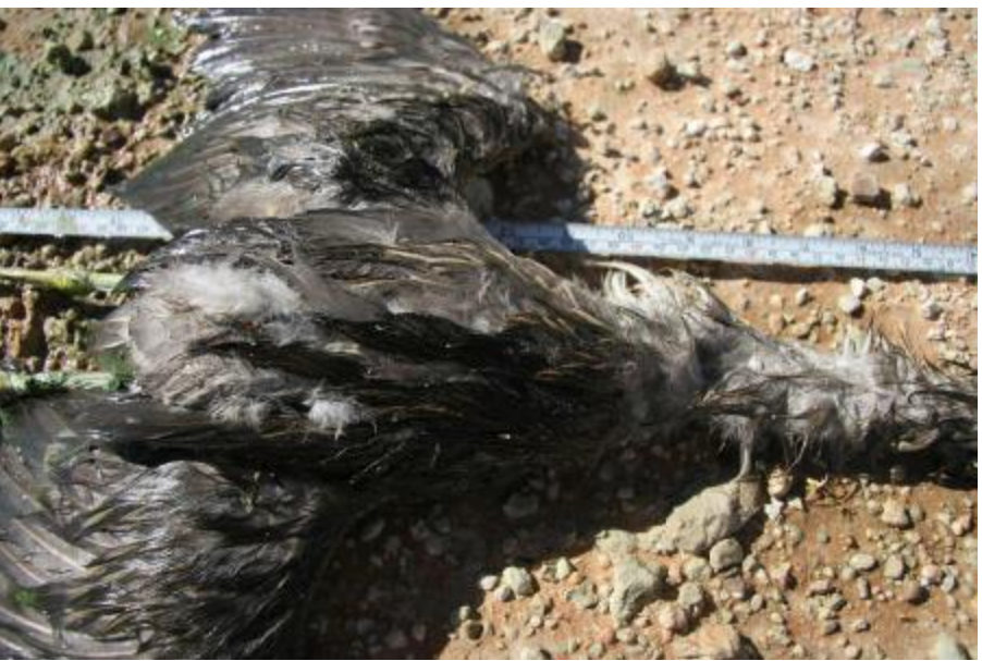
Figure 9 – Rufous streaking on the scapulars