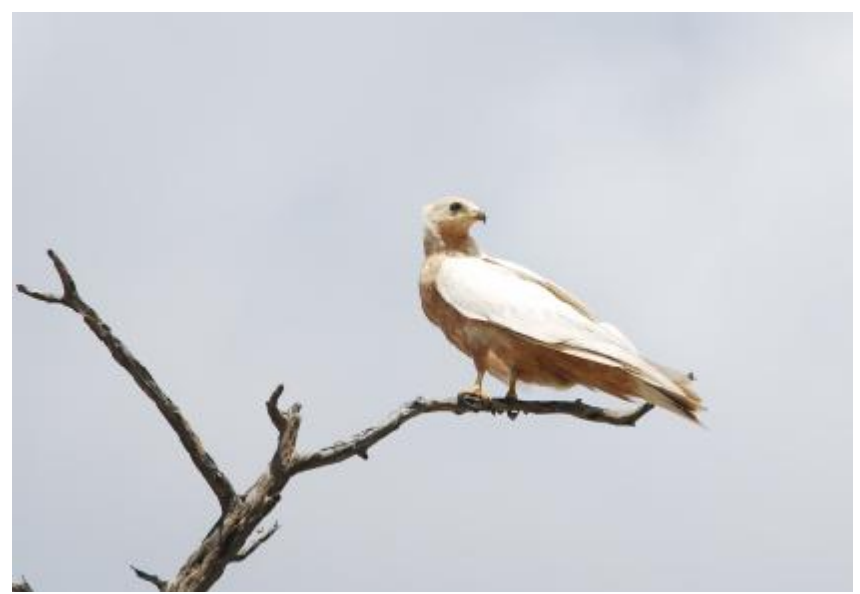
Figure 2 – Side on view of the leucistic Kite

In Figure 4 one can see the Jackal Buzzard with the almost entirely white breast bar a few chestnut blotches. This individual was seen on numerous occasions by different staff members in the southern parts of the park over a period of 2 months.