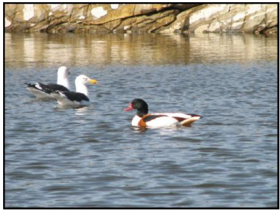
Figure 1 – A male European Shelduck alongside Kelp Gulls at Robben Island, Western Cape, in July 2010. Photo by LGU

An occasional visitor, the species has been sighted year-round in the water-filled quarries at the north and south of the island. Yellow-billed Duck was recorded on 29% of the BIRP cards checked but only 4% of the 76 SABAP2 cards submitted between August 2007 and January 2011. A reduction in the seasonal freshwater habitat, following the expansion of Rooikrans around the sandy beach area (on the east of the island), may have led to the apparent decrease in sightings of Yellow-billed Duck.