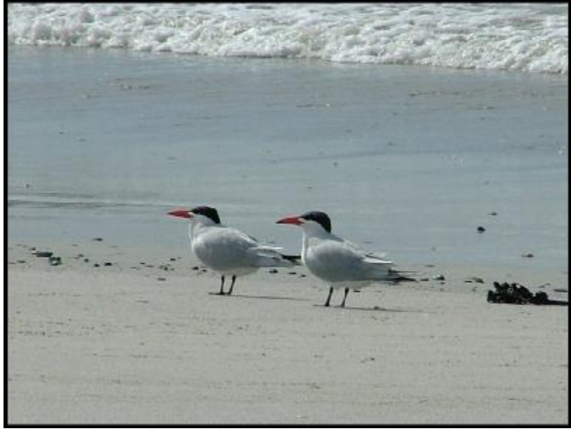
Figure 2 – Two adult Caspian Terns on the sandy beach at Robben Island, Western Cape, on 4 September 2009.

A common summer visitor to Robben Island, Common Tern can usually be seen in large numbers roosting communally with Swift and Sandwich Terns on the island's shoreline. Irregular counts of this species during the last decade have yielded large aggregations of