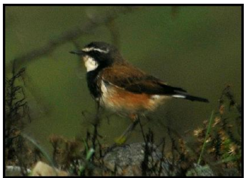
Figure 3 – Capped Wheatear at Robben Island, Western Cape, in May 2011.