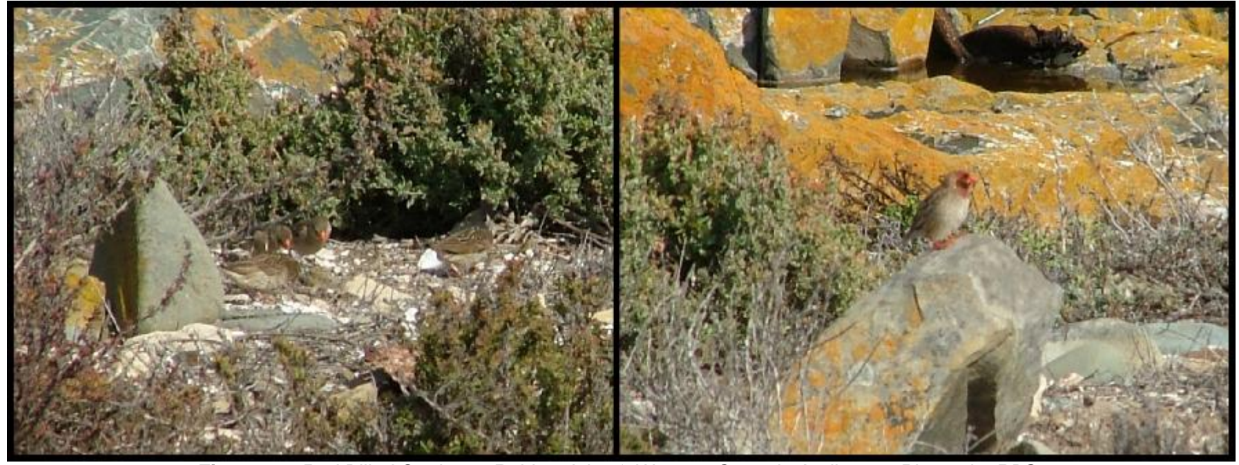
Figure 4 – Red Billed Quelea at Robben Island, Western Cape, in April 2007.