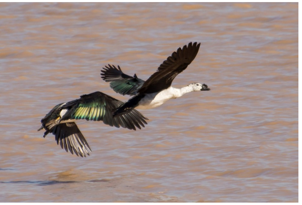
Figure 1 : Knob-billed Ducks - Willem Pretorius Game Reserve, 5 May 2019.

Ten days later (14 May 2019), while traveling from Bethlehem to Bloemfontein, I noticed a small dam next to the N1 about 10 km north -east of the Verkeerdevlei Tollgate, at 28° 42' 46.8"S, 26° 45' 03.6"E. The dam was almost fully covered with knotweed (most likely Persi caria lapathifolia , but possibly P. decipiens ); as I drove past at 120 km/h, I saw one bird on the bank which I suspected could be a Knobbilled Duck. I drove on for a few kilometres before I could safely make a U-turn to confirm it. Back at the dam, I noticed that there were other duck species present: White-faced Whistling-Duck Dendrocygna vidu ata and Yellow-billed Ducks Anas undulata , Red-billed Teal A. erythrorhyncha , Cape Shoveler A. spatula , South African Shelduck