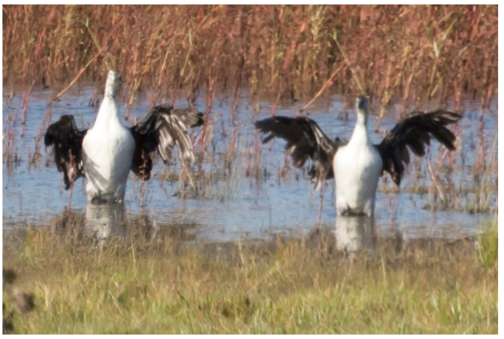
Figure 4 : Knob-billed Duck in flightless moult - series of same individual 2, which is still losing its old flight feathers.

My thanks to Brian Colahan for commenting on this note.