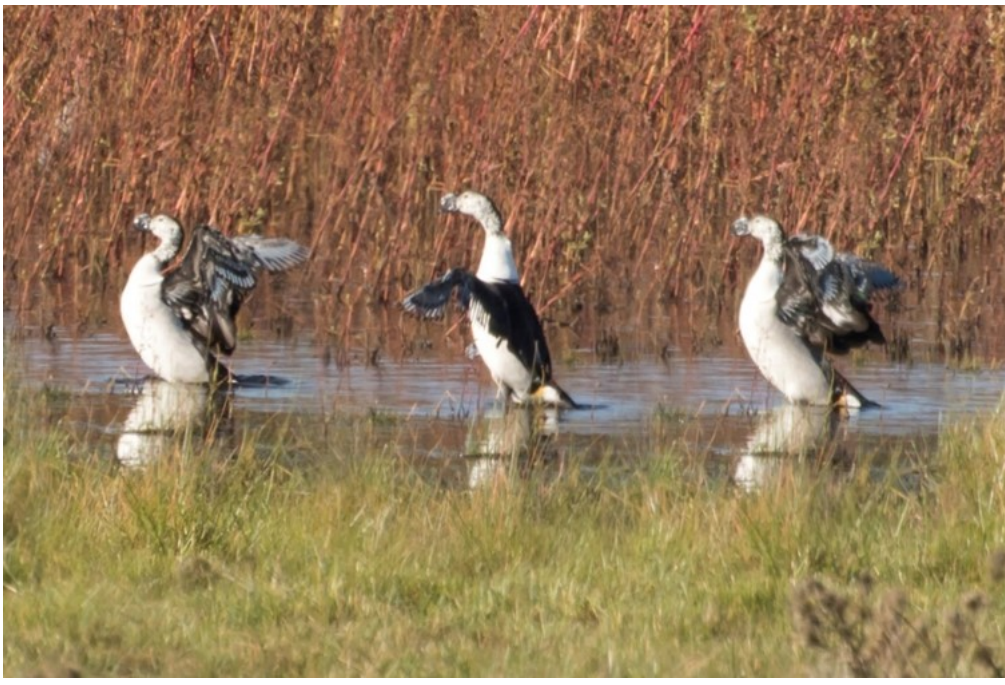
Figure 3 : Knob-billed duck in flightless moult - series of same individual 1, which has lost all its flight feathers and is growing new ones.

While still able to fly from the dam, these birds fed on groundnuts and sunflower seeds being cultivated on the surrounding farmland.