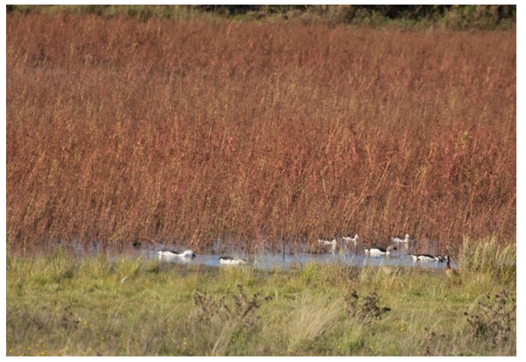
Figure 2: Knotweed-covered dam with Knob-billed Duck.

It intrigued me as to why they would select this spot to moult so I contacted Brian Colahan, former ornithologist with the Free State Provincial Government; he replied that that he had only one previous record of moult for this species in the Free State, at Koppies Dam in May 1993.