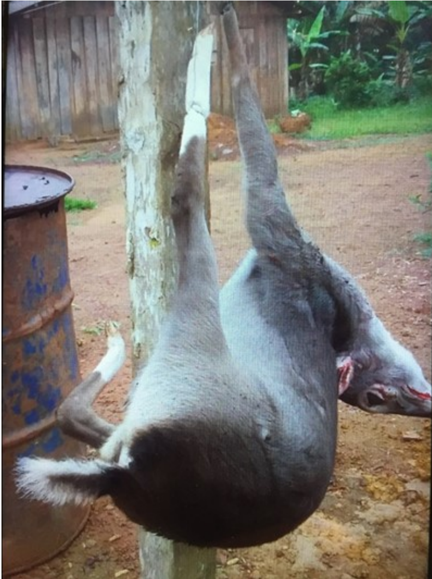
Figure 3: The blue duiker Philantomba monticola specimen reported near the city of Makokou, Ogooué Ivindo Province, northeastern Gabon.