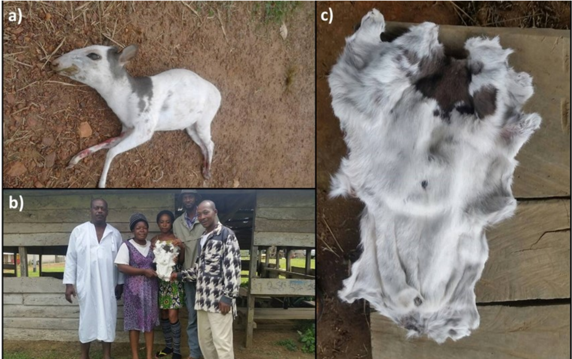
Figure 2: The blue duiker Philantomba monticola specimen reported by the village Konoville les deux Eglises, in the Woleu-Ntem Province, northern Gabon: (a) the entire specimen, and (b and c) and the left-over skin after the meat was sold.