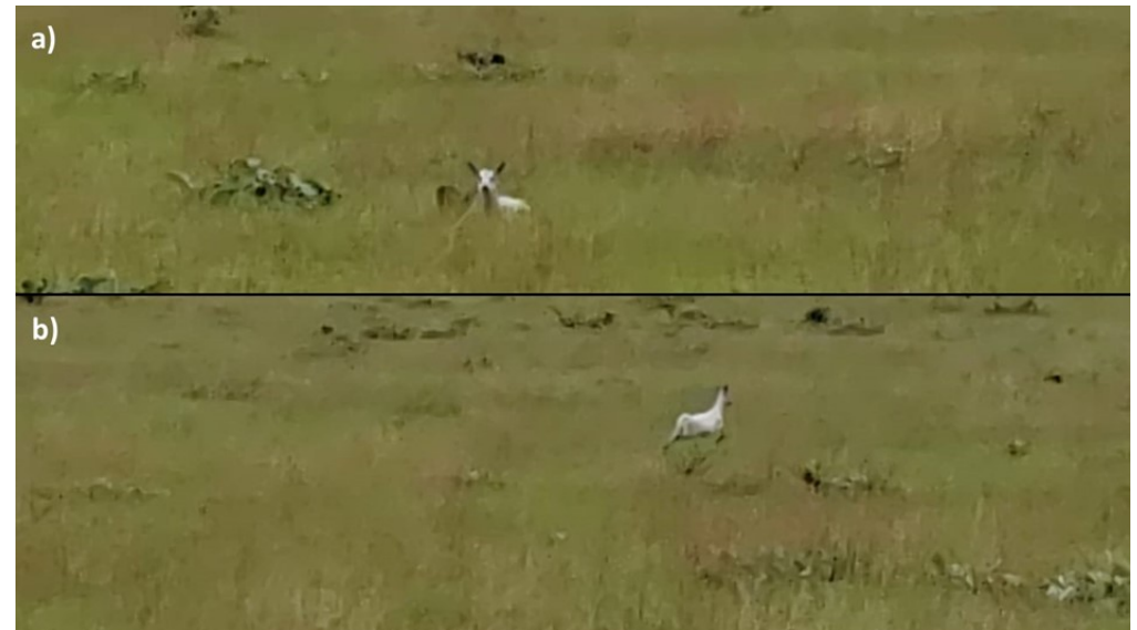
Figure 4: The common duiker Sylvicapra grimmia (a and b) specimen reported in Lekoni Park, southeastern Gabon.