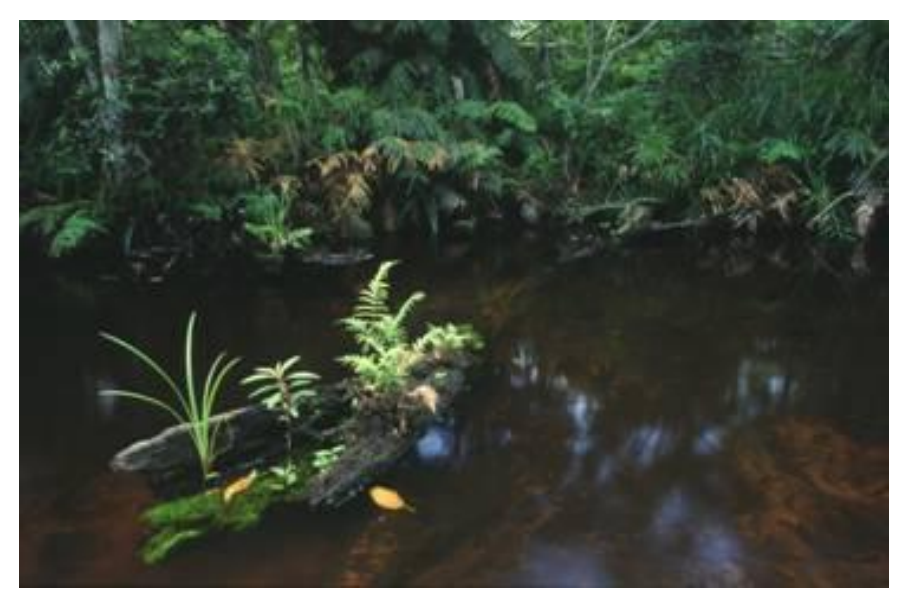
Fig 8 - Swamp Forest at the Mbazwana Stream.

This habitat forms a strip 100 m wide on average along the Mbazwana Stream which flows from north to south. It separates the coastal plain from the inland dune system in the northern area. Permanently wet underfoot, it has a dense undergrowth of ferns and a closed canopy up to 20 m high. Trees include Ficus trichopoda , Syzygium cordatum , Rauvolfia caffra and Macaranga capensis . There is a resident population of Samango Monkeys Cercopithecus mitis .