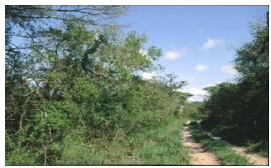
Fig 15 - Woodland on deep sand near Yengweni Pan.