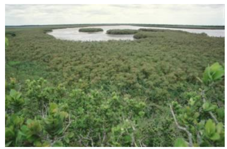
Fig 9 - Swamp at Mdlanzi Pan.