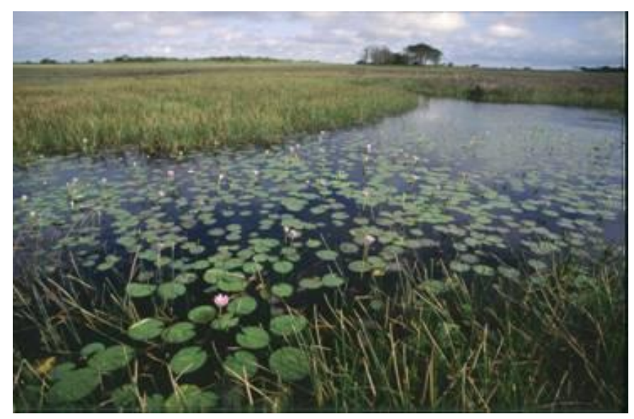
Fig 7 - Coastal Pan near KwaMbila.

coastal pans and marshes is subject to cyclonic influence and summer rainfall. Cyclone Domoina caused widespread flooding of the coastal grassland, forming numerous pans which were fringed with T. latifolia and S. littoralis and many covered with N. caerulea and N. indica . Towards the end of the ten-year study, all of these pans had dried up leaving remnant marshes containing mainly S. littoralis .