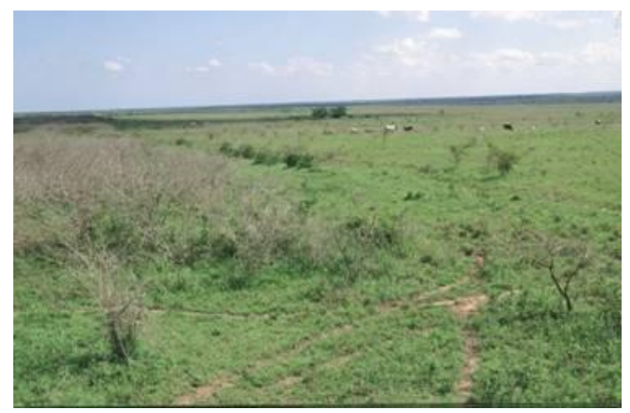
Fig 20 - Cultivated lands at Lower uMkuze.