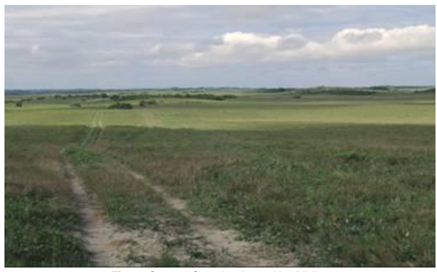
Fig 6 - Coastal Grassland near KwaMbila.

Trees include Syzygium cordatum, Acacia karroo, Dichrostachys cinerea, Strychnos spinosa , and Strelitzia nicolai . The woody forb Helichrysum kraussii is prominent, and grasses are dominated by Imperata cylindrica and Cymbopogon validus .