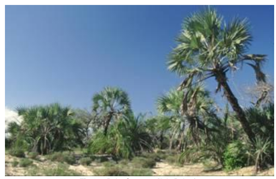
Fig 10 - Palm Sananna (Ilala Palms).