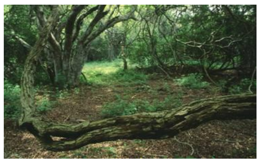
Fig 5 - Dune Forest remnant within Coastal Grassland.