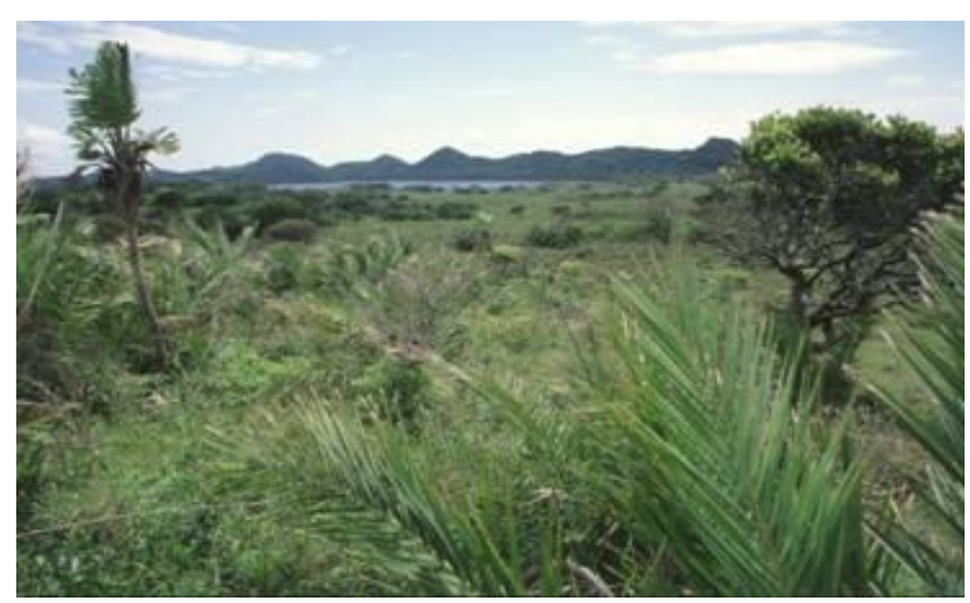
Fig 4 - Dune Forest, Coastal Scrub and Coastal Freshwater Lake at Lake Bangazi North.