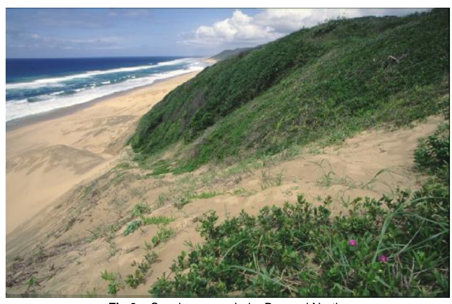
Fig 3 - Seashore near Lake Bangazi North.

Sandy shore with occasional rocky outcrops in the tidal zone.