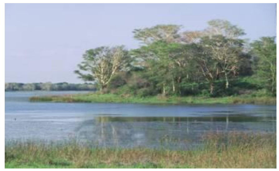
Fig 17 - Floodplain: eastern side of Muzi Pan.