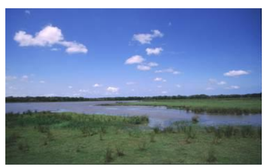
Fig 18 - Floodplain southern end of Muzi Pan (outlet).