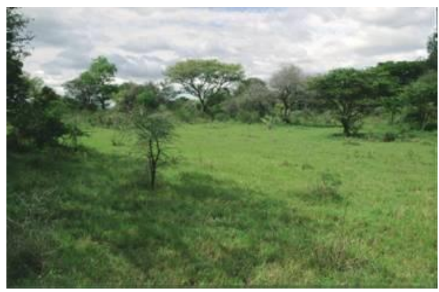
Fig 14 - Mixed Woodland near Yengweni Pan.