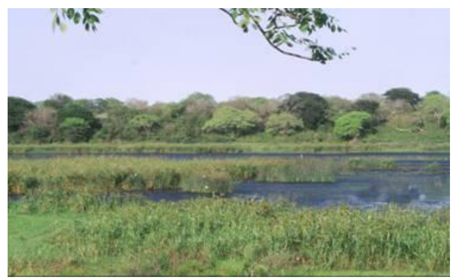
Fig 16 - Floodplain: northern end of Muzi Pan (inlet).