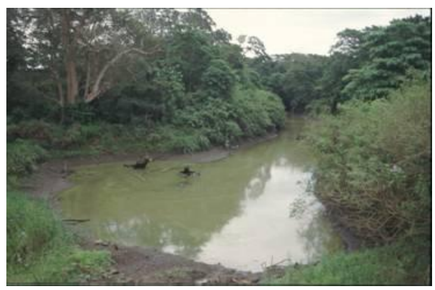
Fig 19 - Riverine Forest: Mkuze River at Lower Mkuze.

A small area south of the Mkuze River at Lower Mkuze that formed part of the study area at the outset of the project. It was used for intensive crop production, but was subsequently abandoned, allowing encroachment of thorn bush mainly Acacia nilotica . This area was later transferred to Mkuze Game Reserve, but continued to be included in this study.