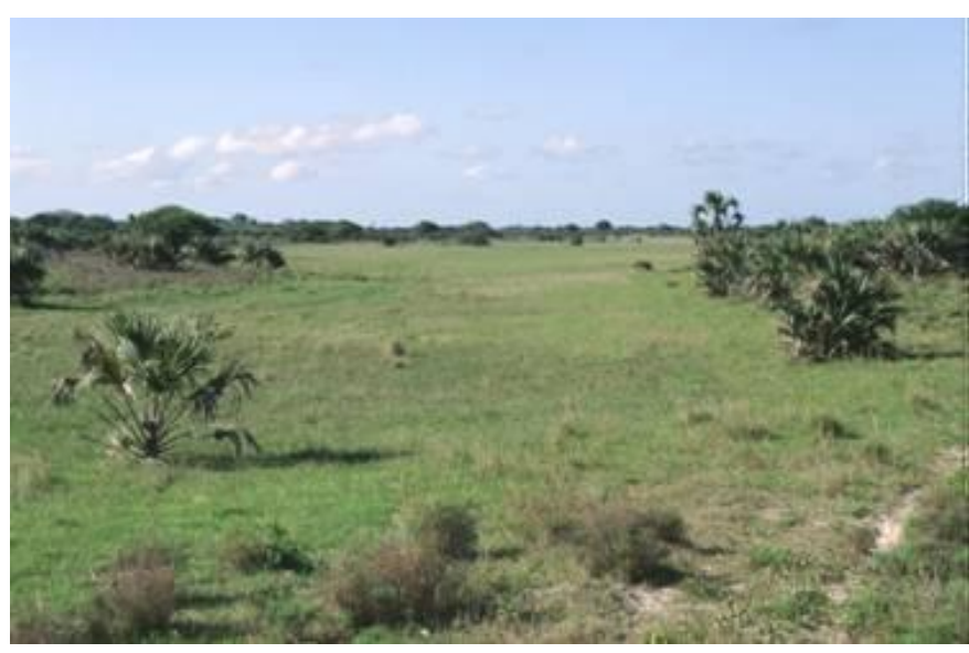
Fig 13 - Inter-dune Grassland bordered by Palm Savanna.