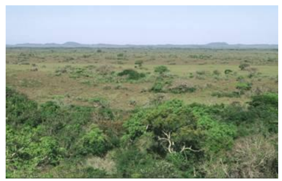
Fig 12 - Palm Savanna and Inter-dune Grassland. In the distance Swamp forest, Coastal Grassland and dune forest.