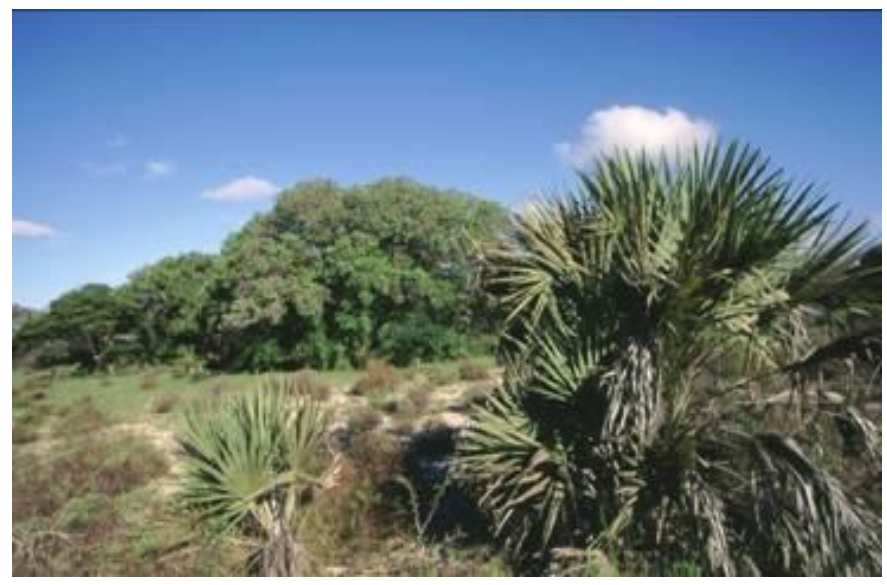
Fig 11 - Palm Savanna (Umdoni trees and Ilala Palms).