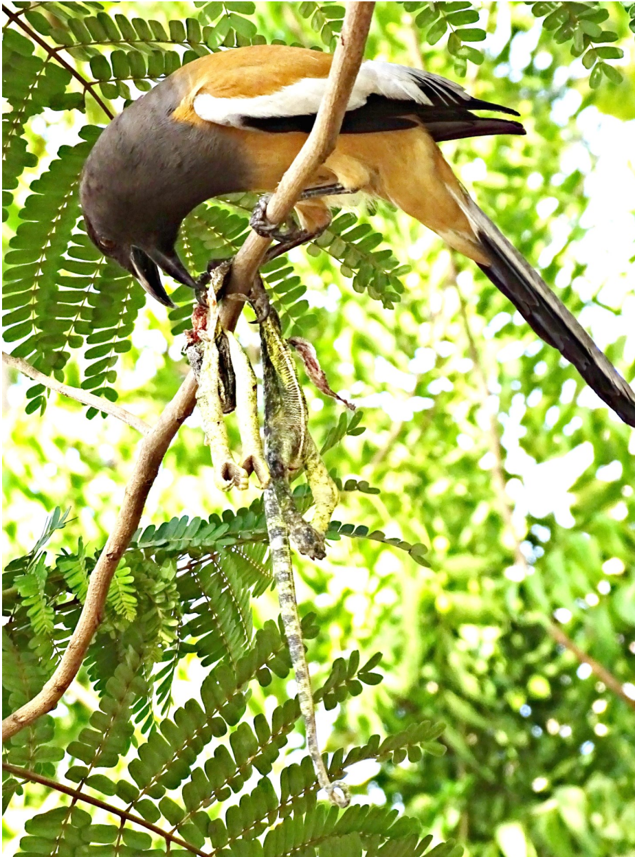
Figure 1: Rufous Treepie Dendrocitta vagabunda with its prey Indian Chameleon Chamaeleo zeylanicus at Janbughoda Wildlife Sanctuary, Gujarat, India.

We observed that the bird took 22 minutes to devour the entire lizard. We do not whether the chameleon was caught in dense vegetation or on open ground. This observation is probably the third record of predation of the Indian Chameleon by an avian species in India. Earlier records show that an Indian Chameleon was predated by a Crested Serpent Eagle Spilornis cheela from Kolli Hills, Tamil Nadu (Gokula 2012), and by a Greater Coucal Centropus sinensis in Gandhidham, Kutch (Joshi 2018) (Table 1).