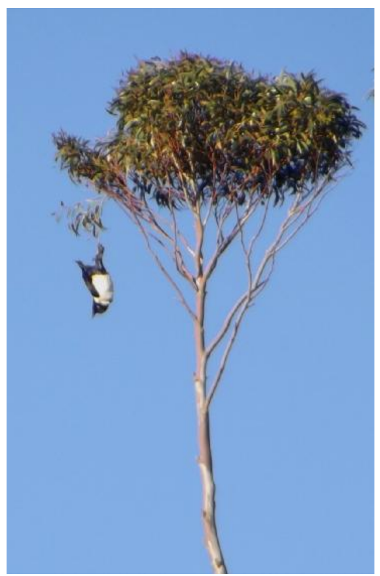
Fig 2 – Pied Crow "dive bombing" from tree

was posted on flickr (<u>http://www.flickr.com</u>) – a Yahoo website where photos can be shared.