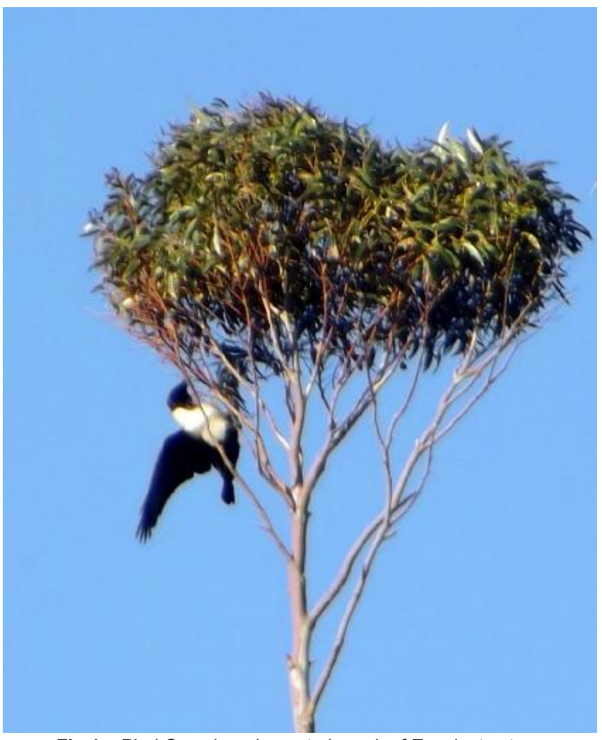
Fig 1 – Pied Crow hanging onto branch of Eucalyptus tree

Roberts Birds of Southern Africa (7<sup>th</sup> edition) does not report on this kind of behaviour. A search on the internet produced a few reports,