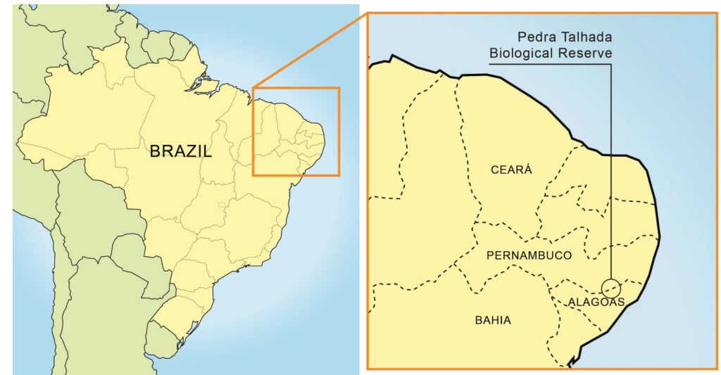
Figure 1: Location of the study area. Alagoas, northeastern Brazil.

The Pedra Talhada Biological Reserve itself spans 4,469 ha and is