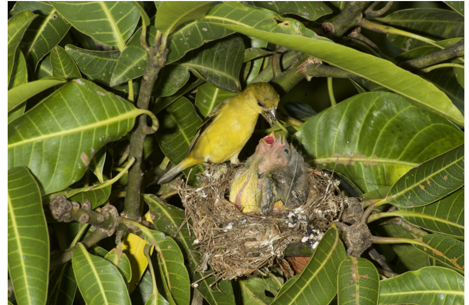
Figure 6: Female Yellow-faced Siskin Spinus yarrellii feeding the chicks at Quebrangulo, Alagoas, Brazil.

The female left the nest at 08:45, returned 10 minutes later, at 08:55, apparently without food, and once again brooded the chicks. Soon afterwards, she cleaned the nest, swallowed the droppings, lay down and, sitting on the chicks, started cleaning the nest again. At 09:35, she flew from the nest just as the male arrived to feed the chicks.