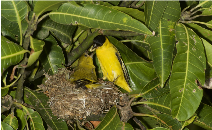
Figure 8: Male Yellow-faced Siskin Spinus yarrellii feeding the female in the nest at Quebrangulo, Alagoas, Brazil.