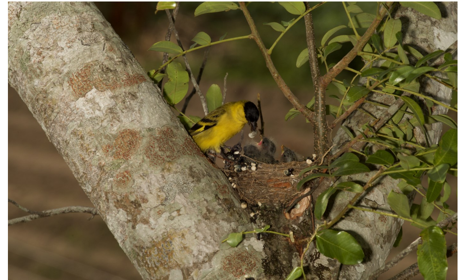
Figure 12: Male Yellow-faced Siskin Spinus yarrellii collecting and swallowing the faecal sacs and faeces ejected and stuck to the side of the nest at Quebrangulo, Alagoas, Brazil.