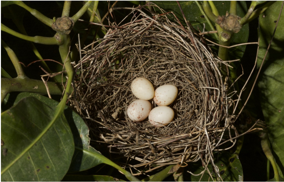
Figure 2: A Yellow-faced Siskin Spinus yarrellii nest with four eggs at Quebrangulo, Alagoas, Brazil (Nordesta Collection).