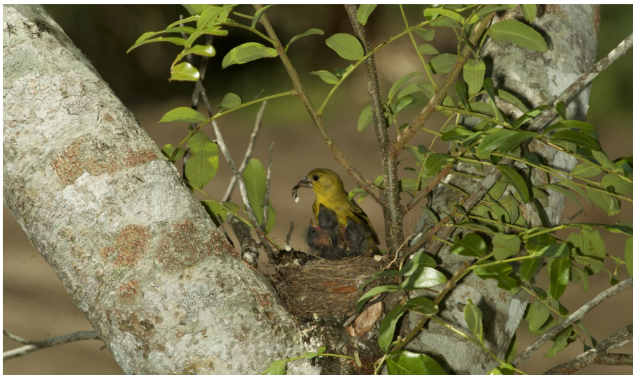
Figure 11: Female Yellow-faced Siskin Spinus yarrellii cleaning the nest, collecting and swallowing the faecal sacs at Quebrangulo, Alagoas, Brazil (Nordesta Collection).