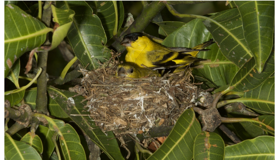
Figure 4: Female Yellow-faced Siskin Spinus yarrellii incubating eggs with male next to her in the nest at Quebrangulo, Alagoas, Brazil (Nordesta Collection).