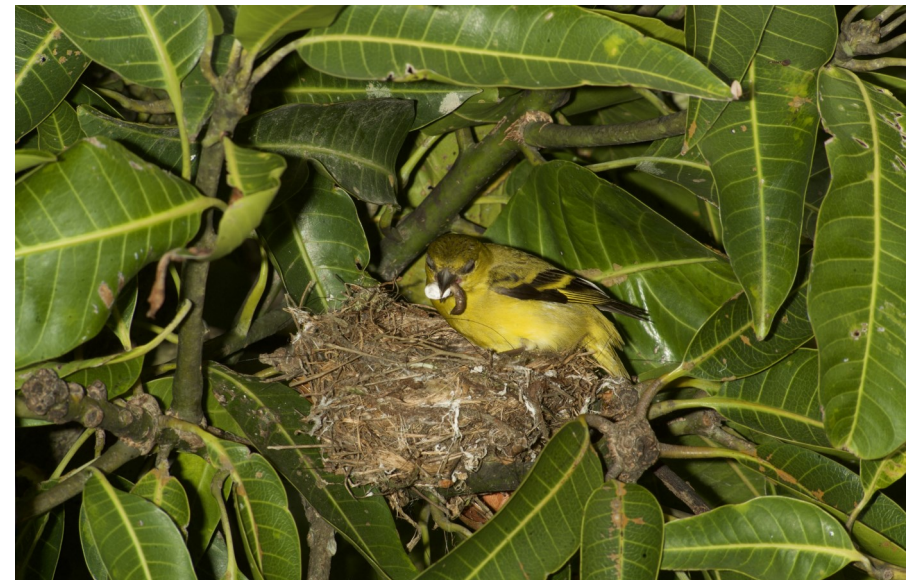
Figure 7: Female Yellow-faced Siskin Spinus yarrellii collecting faecal sacs at Quebrangulo, Alagoas, Brazil (Nordesta Collection).