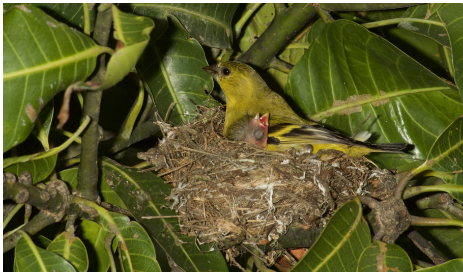
Figure 3: Female Yellow-faced Siskin Spinus yarrellii brooding the nestlings at Quebrangulo, Alagoas, Brazil (Nordesta Collection).