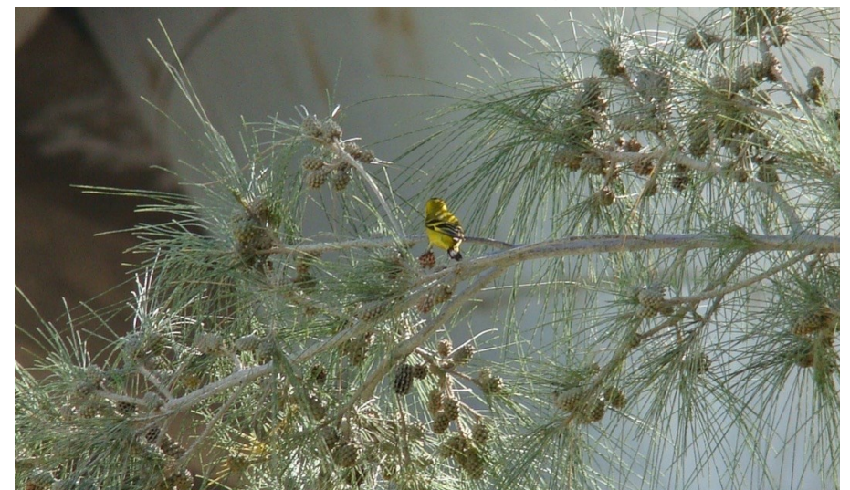
Figure 13: Female Yellow-faced Siskin Spinus yarrellii among fruit of Casuarina Tree Casuarina equisetifolia , next to a cement factory boiler at Sergipe, Brazil (Nordesta Collection).