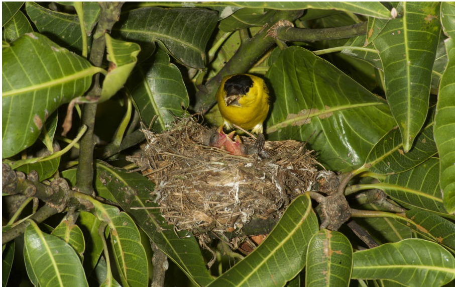
Figure 10: Male Yellow-faced Siskin Spinus yarrellii in the nest feeding the chicks at Quebrangulo, Alagoas, Brazil.