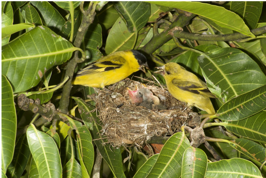
Figure 9: Male and female Yellow-faced Siskins Spinus yarrellii feeding the nestlings at Quebrangulo, Alagoas, Brazil (Nordesta Collection).