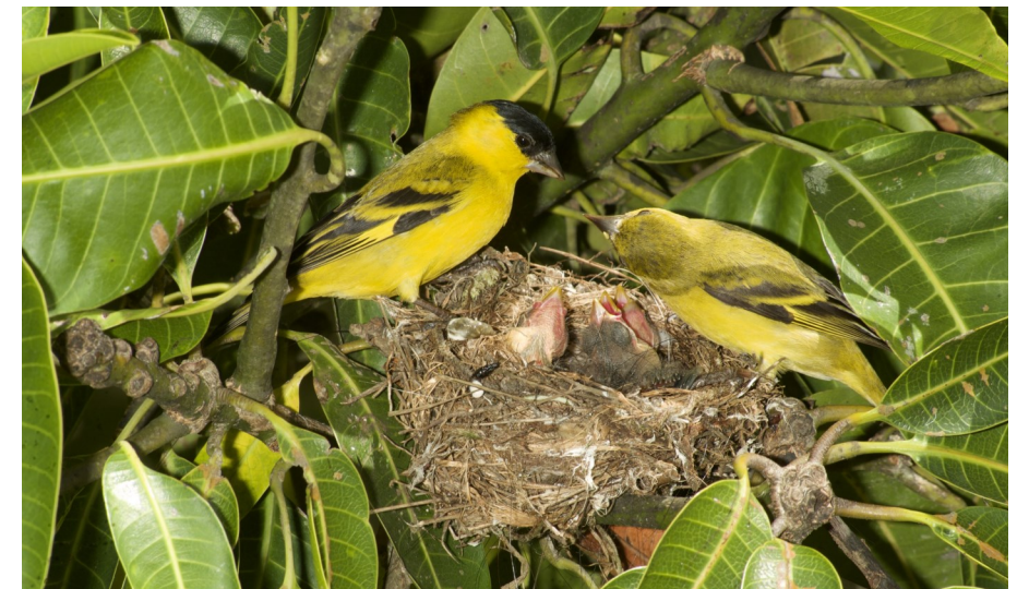
Figure 5: Pair of Yellow-faced Siskin Spinus yarrellii feeding nestlings a few days after hatching at Quebrangulo, Alagoas, Brazil.