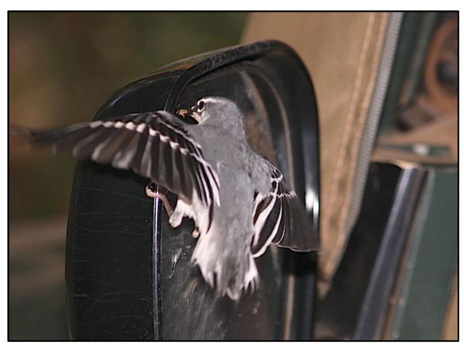
Fig 4 – A Mountain Wagtail Motacilla clara shadow boxing near Malelane, South Africa.

The pair was only observed at one particular window, presumably because this is the only window where the birds can sit or hop in a bush and see their own reflection, but birds are also known to "habitually attack only a particular window" (The Royal Society for the Protection of Birds 2012). The only other bird species that was occasionally recorded at this window showing a mild interest in its reflection was a male Spectacled Weaver Ploceus ocularis . The sunbirds would not fly inside if the window was open, which is consistent with existing literature (e.g. Koumly 1893). The birds were also not distracted if a person stood close to the window inside the house, consistent with many accounts including birds being