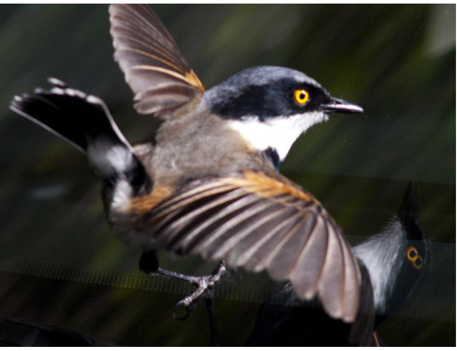
Fig 5 - A Cape Batis Batis capensis shadow boxing.

Reactions to shadow boxing tend to vary from amused and entertained to annoyed and worried. A Crested Barbet was reported pecking so hard "I wonder if it's going to break the kitchen window" and a Cape Robin-Chat Cossypha caffra "scratched the glass on the right rear view mirror, not to mention the mess they left on the door". A Collared Sunbird was suspected "trying to peck itself to death in our car wing mirrors and windows" and a Pin-tailed Whydah was believed to fight "itself to exhaustion and death [...] on this rather hot day".