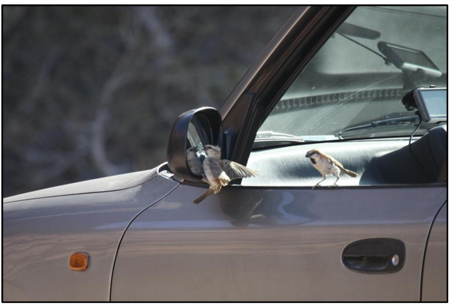
Fig 3 – While the male watches, a female Great Sparrow Passer motitensis attacks a car mirror in Spitzkoppe, Nambia.

Observers of shadow boxing sometimes worry about the damage the behaviour causes, like in the case of the window breaking Magpielark (Ford 1903). Larger, stronger species do more damage. "Obsessive" shadow boxing of the Australian kingfisher-like Laughing Kookaburra Dacelo novaeguineae is reported to frequently cause broken windows (Temby 2004) and in Africa Southern Ground-Hornbills Bucorvus leadbeateri notoriously destroy windows (Mabula Ground Hornbill Conservation Project 2012) and even vehicles if the bodywork is very reflective (Greve 2008). The constant ticking of shadow boxing birds and dirty marks on the glass annoys some people (e.g. Temby 2004). Shadow boxing can only be prevented by removing the reflection (The Royal Society for the Protection of Birds 2012, The Cornell Lab of Ornithology 2012). One of the ways to do this is to put transparent cling foil against the outside of a window (Vogelbescherming 2011).