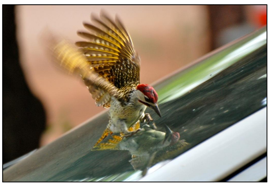
Fig 1 – A male Bennett's Woodpecker Campethera bennettii attacks the windscreen of a vehicle in Satara, Kruger National Park, South Africa.

latter term was also used by the Southern African ornithologist Jack Skead and is adopted in this study.