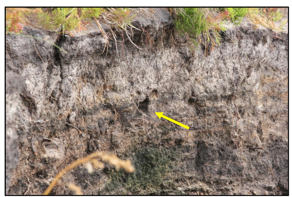
Fig 2 - Close up of the nest site of the Black Saw-wing.

burrow without a pause at the entrance, spending about a minute inside and then flying off. On one occasion, both adults arrived simultaneously. One adult entered the burrow, while the other flew out of sight, and returned a few minutes later after the first adult had left the nest. Thus presumably they were feeding chicks within the nest.