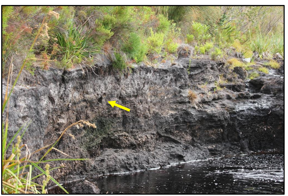
Fig 1 – The vertical bank with the nest site indicated by the arrow.

In the Bettys Bay flood of 2004, the Dawidskraal River, which flows from the Harold Porter National Botanic Gardens to the sea changed its course, washing away the Dawidskraal Road and creating a new