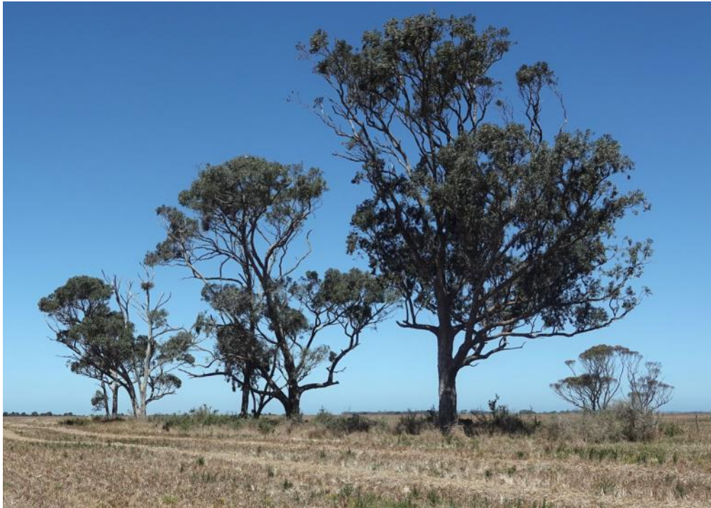
Figure 9: The wheat around the nest on the Agulhas Plain had been harvested before our visit on 29 November 2024. From this angle, the nest is at the top of the leftmost cluster of Eucalypts.