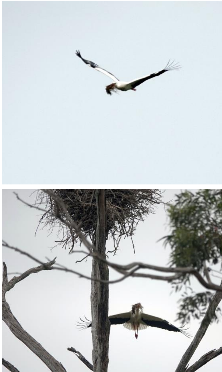
Figure 8: (Top) The second bird in the pair of White Storks brings nest material to the nest on the Agulhas Plain, 10 October 2024. The third photograph (right) shows the nest material being incorporated into the nest by the pair.