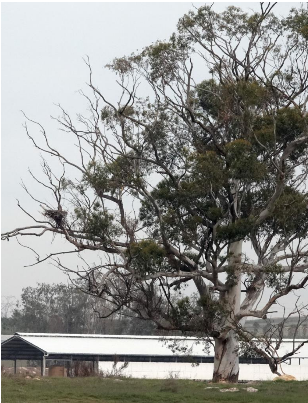
Figure 2: Unoccupied nest of White Stork at Zandam Farm, 22 May 2024.