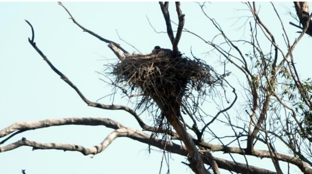
Figure 6: An Egyptian Goose was sitting in the nest of the White Stork at Zandam Farm on 5 November 2024.