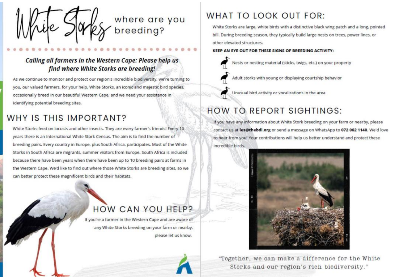
Figure 1: Article in the May 2024 edition of the newsletter of Agri Western Cape appealing to farmers to be alert to White Stork nests on their farms