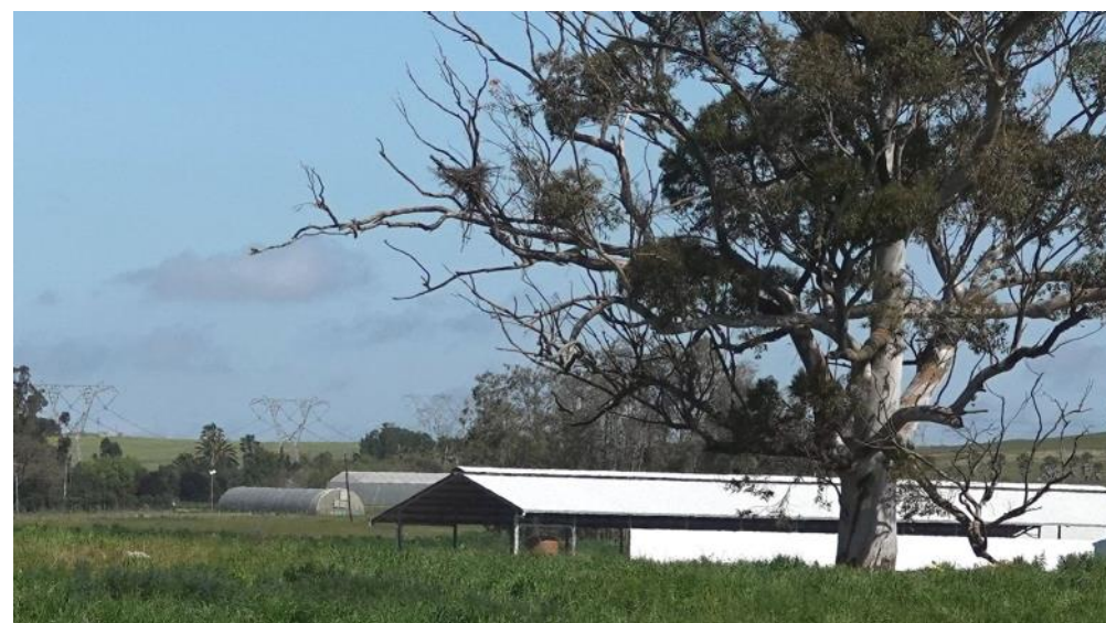
Figure 3: Unoccupied nest of White Stork at Zandam Farm, 17 September 2024.

The nest was first observed on 20 May 2024 by Gigi and Dennis Laidlaw. The nest was in an isolated eucalyptus tree at 33.7647°S, 18.7996°E, 150 m from the R112 road between Durbanville and the T-junction with the R44, west of the Paarl Mountains. The nest was clearly visible from the R112. On 20 May, the pair were on the nest; they displayed the pair-greeting behaviour of bill-clapping with their heads thrown far back. When we visited on 22 May 2024 the pair was seen in the district, but there were no birds on the nest which was well-constructed on a branch of an isolated Eucalypt, an alien tree species (Figure 2). On 17 September, there were no storks on the nest; the pair was feeding in the same field that the nest tree was in, within about 400 m of the nest (Figures 3 and 4). On 24 September 2024, a White Stork was observed standing at the nest (Figure 5). However, by 5 November 2024, the nest had been taken over by Egyptian Geese Alopochen aegyptiacus (Figure 6). No White Storks were visible.