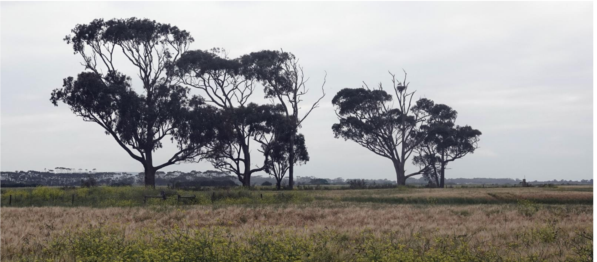
Figure 7: One White Stork is standing on its nest on the Agulhas Plain on 10 October 2024. The nest is at the centre at the highest point of the rightmost of the cluster of alien Eucalypt trees. These trees are along a fence line with large areas of wheat in the fields on both sides of wheat.

11h00. We next visited the nest on the afternoon of 29 November 2024. A single bird was sitting on the nest, presumably incubating eggs or brooding small young (Figures 9 and 10). It was a windy day. At 10h30, on 12 December 2024, another extremely windy day, there was one adult sitting low on the nest. There was no sign of chicks. The observers remained in the area for an hour. We do not know whether the breeding attempt produced fledglings.