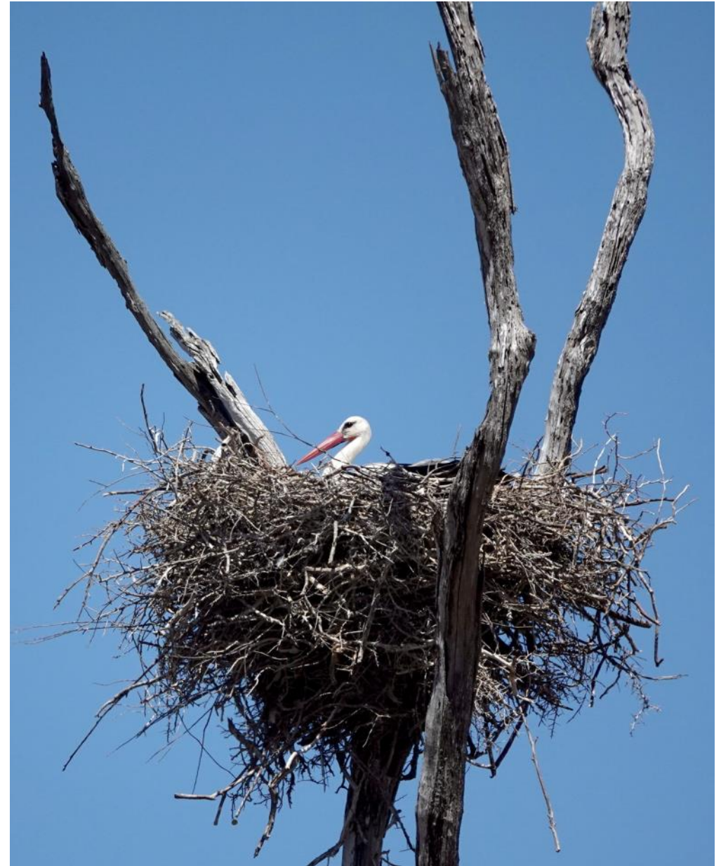
Figure 10: White Stork sitting on its nest on the Agulhas Plain, 29 November 2024. It was a windy day, and we do not know if it was incubating eggs or brooding young.

This paragraph is arranged in order of first breeding record of the remaining five species. The Common House Martin Delichon urbicum has been recorded breeding in southern Africa, randomly in space and time, with the first record in 1928 (Earlé 1997). Two breeding records of the Western Osprey Pandion haliaetus are considered authentic (Dean & Tarboton 1983). They were made in 1933 and 1963. The Glossy Ibis Plegadis falcinellus was first recorded breeding in both the Witwatersrand and the Cape Peninsula in the 1950s