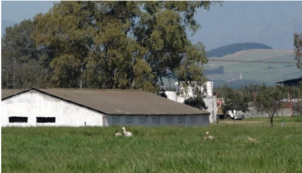
Figure 4: Pair of White Storks feeding in the field at Zandam Farm, 17 September 2024. The nest tree (Figures 1 and 2) was c. 400 m to the right of the storks. The third bird in the photo is an African Sacred Ibis Threskiornis aethiopicus .