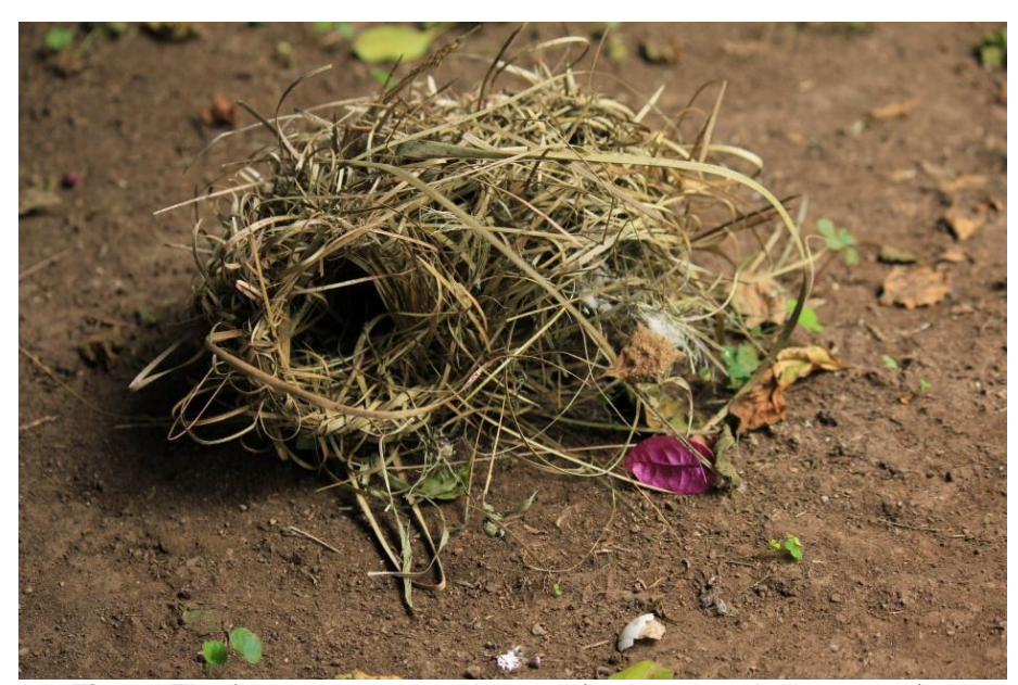
Fig. 2 - The first nest that was dropped (broken egg shell next to it).