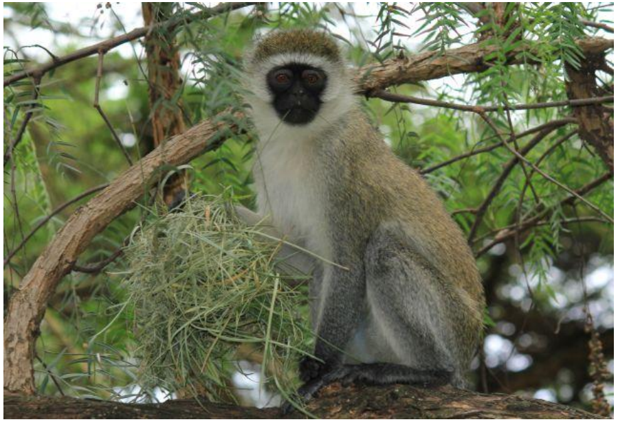
Fig. 3 - Vervet Monkey with Baglafecht Weaver nest.