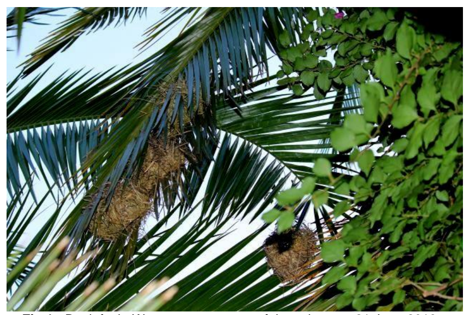
Fig 1 - Baglafecht Weaver nests – part of the colony on 21 June 2013.

On 25 June 2013 a young male of the local Vervet Monkey Cercopithecus pygerythrus troop raided the Baglafecht Weaver nest site (see PHOWN 5892). Although there were other monkeys, he was the only one that took nests. There were two males and one female Baglafecht Weavers in the tree next to the nest site making quite a noise. The monkey first took an old nest which was left on the ground (I presume he did not find anything inside; Fig. 2) and then took a new green nest. He jumped out of the tree and went to another tree where he sat and started ripping the nest apart (Fig. 3). I discovered one egg under the nest site and it looked like he took out another egg while he was sitting in the other tree.