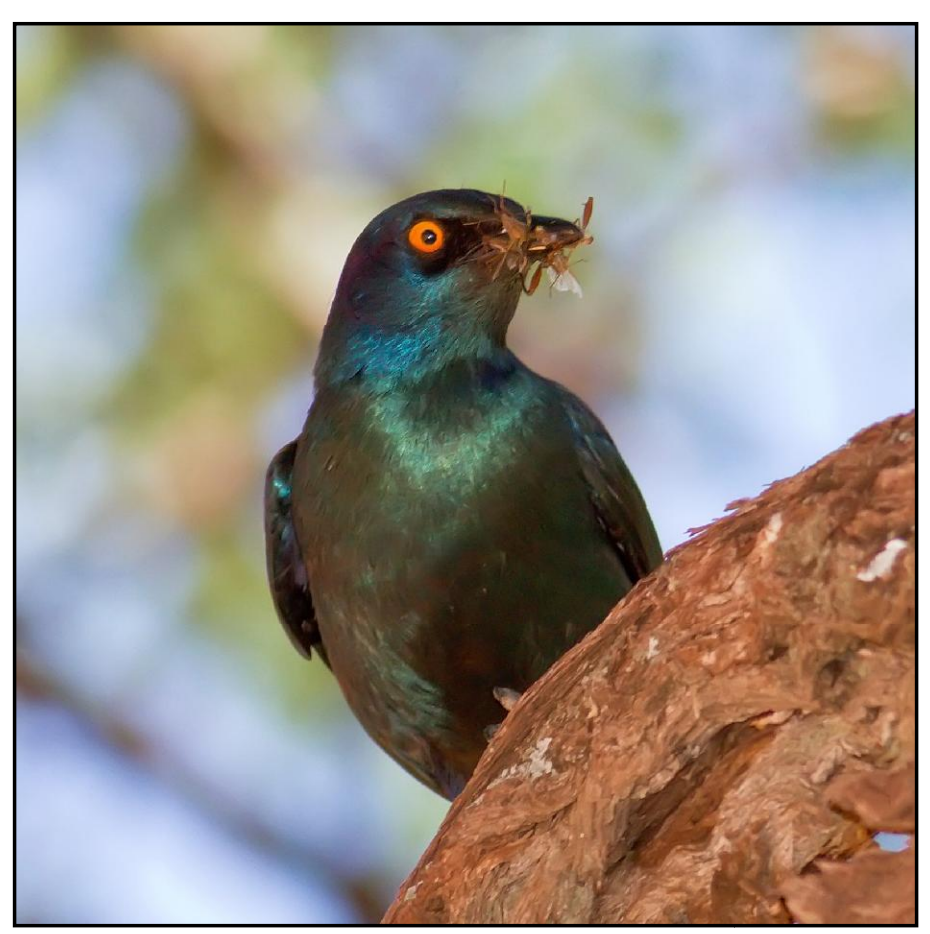
Fig 3 – A Cape Glossy Starling ready to feed its chicks bugs, a food item not recorded in other studies.

Other food items included the orders Hymenoptera (ants; 10.20%), Coleoptera (beetles; 12.24%), Coleoptera/Lepidoptera larva (beetle, butterfly or moth larva; 6.12%), Hemiptera (bugs; 4.08%) and lastly, fruits of a current Searsia plant (8.16%). Unknown items or unidentifiable items constituted for 18.36% of the items brought to