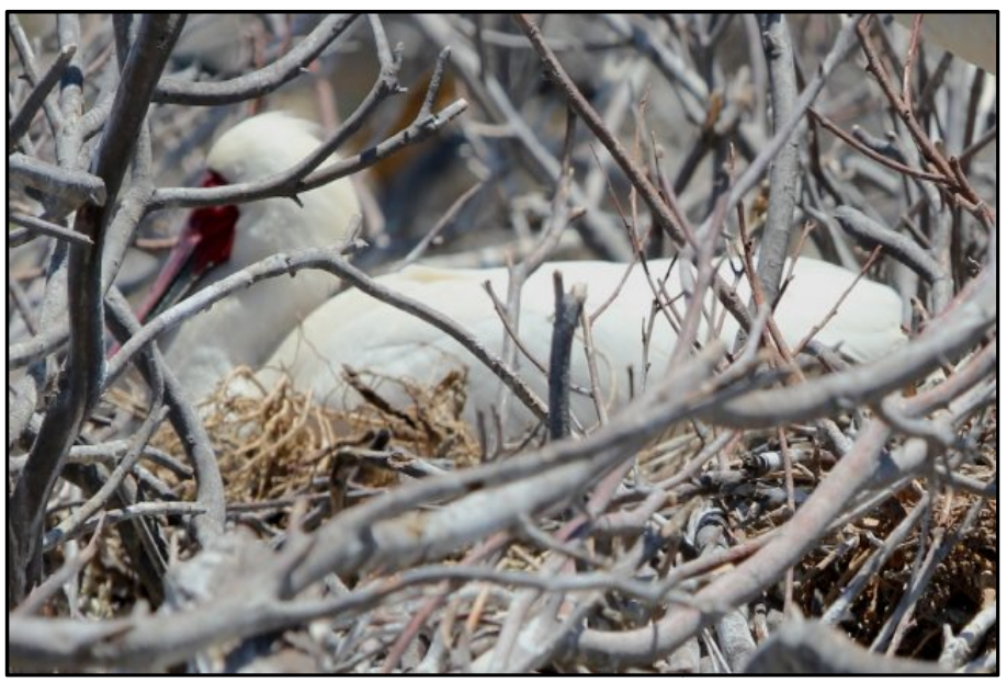
Fig 3 – One of the adult Spoonbills incubating.

Robben Island not only is a safe haven for colonial breeders, but provides breeding habitat for several threatened marine and coastal species. In 2010, Robben Island was host to a globally important (fourth largest) breeding colony of the African Penguin Spheniscus demersus , as well as significant numbers of Swift (Greater-crested) Tern Sterna bergii , Hartlaub's Gull Larus hartlaubii , African Black Oystercatcher Haematopus moquini , Cape Cormorant Phalacrocorax capensis and the Bank Cormorant P. neglectus (Crawford et al. 1994; Crawford and Dyer, 2000; Sherley 2011).