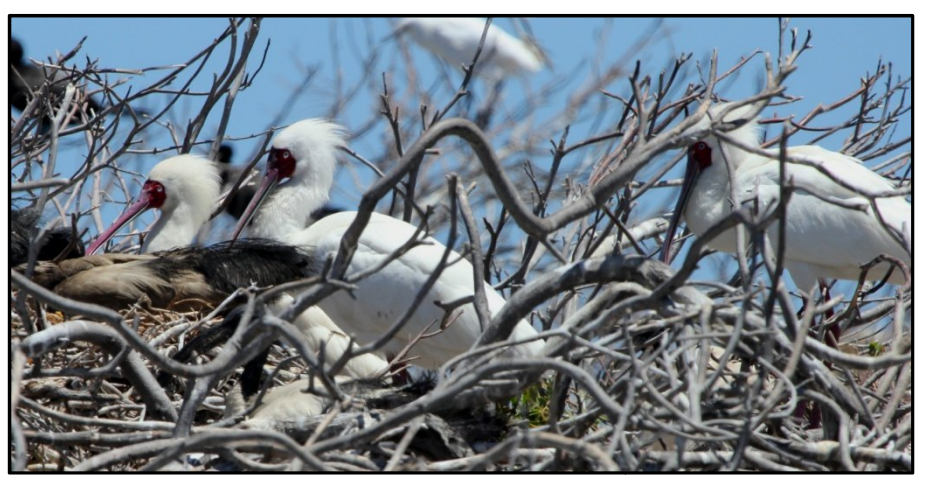
Fig 1 – Adult African Spoonbills at the nesting site in the heronry on the southern side of Robben Island – note the other species sharing the site: Crowned Cormorant, Sacred Ibis, Western Cattle Egret.

The highest point on the island is Minto Hill (30.2 m a.s.l.) where the lighthouse is situated. The rest of the island is relatively flat and the perimeter of the island comprises rocky shores (boulders and sharp jagged slate bedrock) with a small sandy beach on the sheltered east coast just south of Murray's Bay Harbour. Robben Island is 507 ha in extent (Crawford and Dyer, 2000). The coastline is approximately 12 km long. The island is situated in the Fynbos Biome and vegetation types are classified as FS 6 (Cape Flats Dune Strandveld)