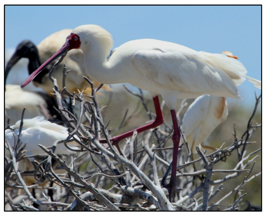
Fig 2 – An adult African Spoonbill just above the nest site with some of the other species sharing the heronry in picture – Sacred Ibis, Western Cattle Egret and Little Egret.

Robben Island not only is a safe haven for colonial breeders, but provides breeding habitat for several threatened marine and coastal species. In 2010, Robben Island was host to a globally important (fourth largest) breeding colony of the African Penguin Spheniscus demersus , as well as significant numbers of Swift (Greater-crested) Tern Sterna bergii , Hartlaub's Gull Larus hartlaubii , African Black Oystercatcher Haematopus moquini , Cape Cormorant Phalacrocorax capensis and the Bank Cormorant P. neglectus (Crawford et al. 1994; Crawford and Dyer, 2000; Sherley 2011).