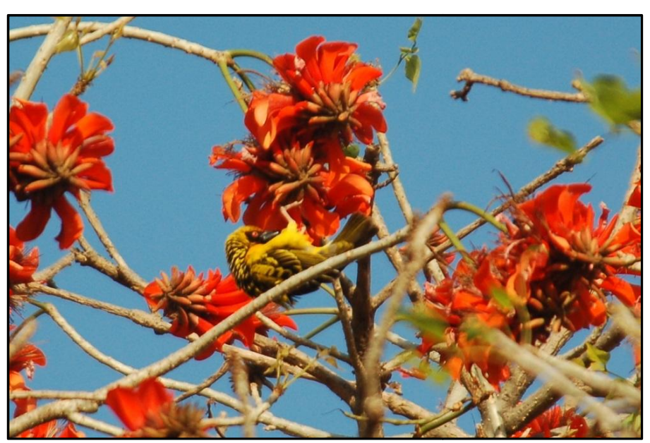
Fig 1 – Village Weaver feeding on nectar of Erythrina , Southport, KwaZulu-Natal, 19 July 2009

Engelbrecht et al. (2014) lists the White-winged Widowbird Euplectes