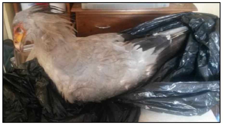
Fig 1 - The Secretarybird just after it was collected from the farmer.

Reflecting on studies made at two nests near Brandvlei, Northern Cape and other previous observations, Peter Stevn and Nico Myburgh (1992) concluded that "contrary to popular belief, snakes are but a small part of the diet of Secretarybirds". Stevn and Myburgh's position has support from other primary studies, e.g. Brown (1955) recorded mostly small mammals and grasshoppers fed to nestlings in Kenya (but a few snakes brought to the incubating female). Broadley (1974) found only three snakes in eight Secretarybird stomachs from Zimbabwe and Botswana. Kemp and Kemp (1978: table 1) recorded just five snakes eaten in a large sample of prey records largely drawn from the central Kruger National Park. Lastly, Kemp (1995: table 3) recorded no snakes delivered to nests watched near Pretoria (although remains of 4 snakes were found in 120 pellets examined). With this background, it was interesting recently to dissect a Secretarybird which had its gizzard and crop bulging with snakes.