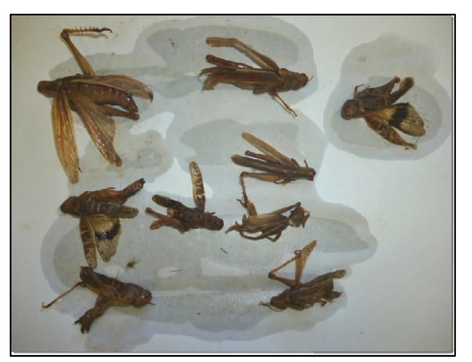
Fig 3 – Photo of some of the grasshoppers eaten by the Secretarybird, the individuals showing black bars in the hind wings are Gastrimargus cf. africanus and the plain, yellow-winged individuals are Heteracris sp.

When the body cavity was cut open it was found that the gizzard (stomach) was distended and dissection revealed two Spotted (Rhombic) Grass Snakes or Skaapstekers Psammophylax rhombeatus ; Lamprohiidae: Psammophiinae, five Cross-marked Grass Snakes Psammophis crucifer , Lamprohiidae: Psammophiinae, 11 grasshoppers and a small amount of dark mammal fur (presumably from a rodent). The two Spotted Grass Snakes were intact and measured 42.5 and 62 cm respectively while the four Cross-marked Grass Snakes measured 18 cm (anterior part of body