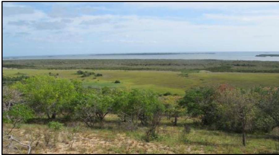
Fig 2 - View over Eastern Vlei (middle area) with mangrove forests and Inhambane Estuary in distance and open miombo savanna in foreground.

the Inhambane Estuary shore, with only occasional patches of dune thicket and even rarer dune forest still existing. In the northern part of the peninsula, the savanna opens up and becomes more scrubby in nature.