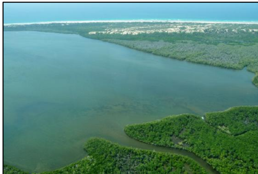
Fig 1 - Southern part of Inhambane Estuary, Vilanculos Coastal Wildlife Sanctuary, San Sebastian Peninsula, with Indian Ocean in distance.

The predominant vegetation in the Sanctuary is low Brachystegia spiciformis (miombo) savanna growing on white, nutrient-poor sands.