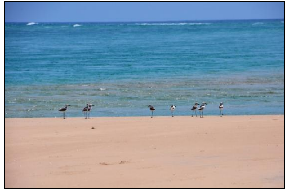
Fig 4 - Flock of eight Crab Plovers on Eastern Sand Spit, VCWS.

Only 22 species have been recorded breeding (nests, eggs, chicks) in the Sanctuary, with a further nine species with vague or circumstantial evidence of breeding (Table 2), but this is obviously too low a figure and further attention should be given to documenting nesting records in the VCWS. Especially significant from a breeding