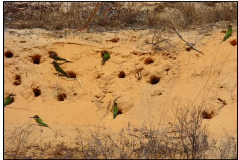
Fig 6 – Olive Bee-eaters at nest burrows.

ecological phenomenon on the peninsula. Such a view gains support from the observations by Robson and Horner (2012) on the Ozabeni coastal plain just north of Lake St Lucia, KwaZulu-Natal (approximately S27°40', E32°34'). Following extremely heavy rainfalls after Cyclone Domoina in late January 1984, many pans and wetlands in that area were inundated. Robson and Horner (2012: 91) noted that "[t]he extent of flooding was far in excess of anything in recent times. The study period [1985-1995] was characterized by a gradual drying out of the coastal plain ... [t]his was reflected by the large and widespread populations of both grassland and aquatic birds present in the early years gradually declining. Cyclonic flooding is recognised as an occasional phenomenon, and Domoina undoubtedly had a dramatic short-term beneficial effect to birds on the coastal plain by providing an increase in aquatic habitat, an influx of nutrients and