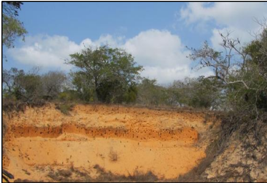
Fig 5 – Active Olive-Bee-eater colony in a sandy embankment.