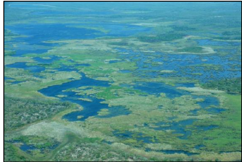
Fig 3 - View of inundated pans in the Vilanculos Coastal Wildlife Sanctuary following cyclonic rainfall.

The topography is flat to lightly undulating with the altitudinal range between 0-65 m asl, although most of the Sanctuary lies below 35 m asl. The predominant substrate is mostly white or reddish sands, except for the dark clays in the grassy vleis and ephemeral and permanent pans. Annual rainfall is quite low, with approximately 600-800 mm/annum, slightly higher in the south. Game animals have been re-introduced into the Sanctuary and currently species include small numbers of Sable Hippotragus niger , Giraffe Giraffa camelopardalis , Eland Tragelaphus oryx livingstonii , Kudu Tragelaphus strepsiceros , Nyala Tragelaphus angasii , Bushbuck Tragelaphus scriptus , Plains Zebra Equus quagga , Blue Wildbeest Connochaetes taurinus , Red Duiker Cephalophus natalensis , Common Duiker