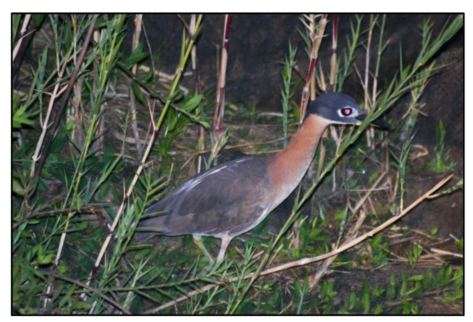
Fig 2 – A White-backed Night-Heron – depicted in habitat very similar to those favoured by the bird in the Kruger National Park as daytime cover.

I have been incredibly fortunate to see this illusive medium sized heron on a number of occasions since 2004. Early in the morning of 12 July 2004 I saw a single adult bird returning to its dense day time roost along the Letaba River at Shimuwini Camp (pentad 2340_3115). This happened every morning I was in camp and over a number of visits thereafter. On one occasion the bird saw me, called angrily and flew off to seek a quieter roost. The roost selected was always dense green reeds even though plenty of densely foliaged overhanging branches were available.