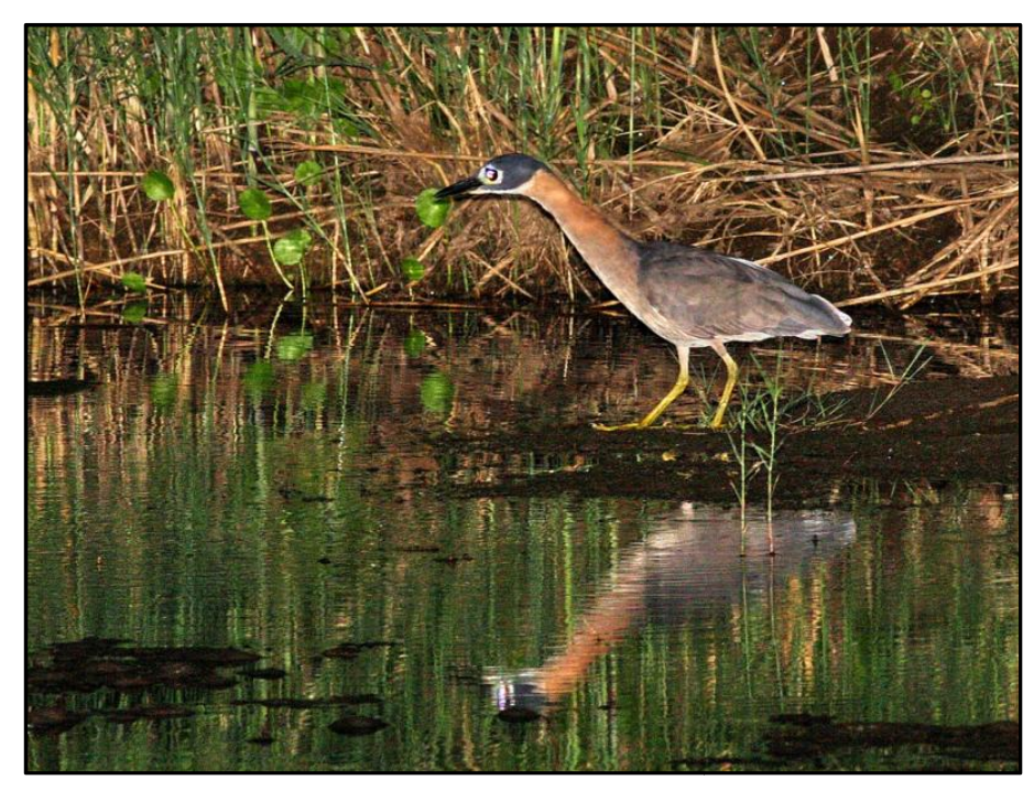
Fig 1 – A White-backed Night-Heron

The behaviour of often being solitary while roosting in dense vegetation in the day is typical (Allan 2005). It is, however, not so typical to choose habitat with dense vegetation overhanging water. The preference for clear and slow-flowing perennial rivers and