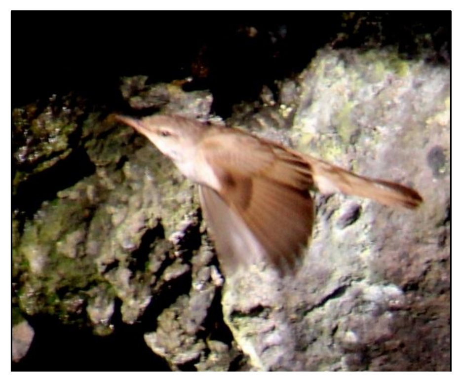
Fig 2 – The Great Reed Warbler which was observed on the north-eastern shore of Marion Island – in flight.

reported at the Prince Edward Islands (Gartshore 1987; Oosthuizen et al. 2009; unpublished data). The only other warbler species to have been recorded on islands in the southern Indian Ocean, is the Willow Warbler Phylloscopus trochilus , which has been reported at both Marion (Gartshore 1987; Oosthuizen et al. 2009) and Kerguelen Islands (Ausilio and Zotier 1989).