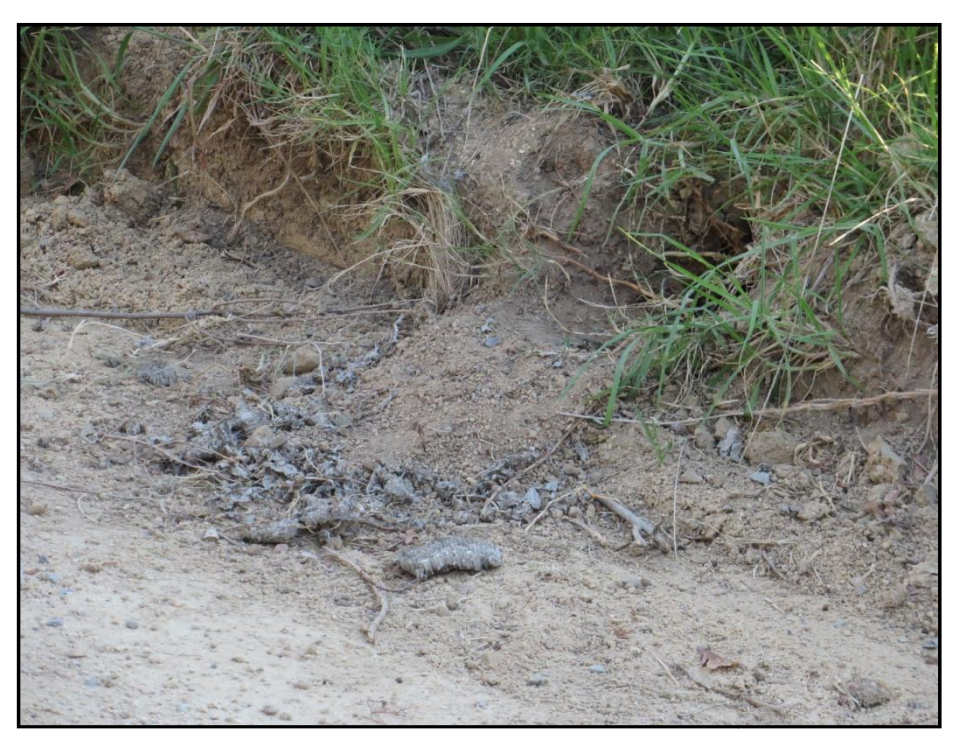
Fig 2 - Wasps' nest, showing entrance hole with grey combs that had been scratched on the road.

photograph the damaged nest with a better camera and hopefully get a better picture of the bird, but it was not seen again. Given the state of the nest, this is not surprising, as there was little left to eat.