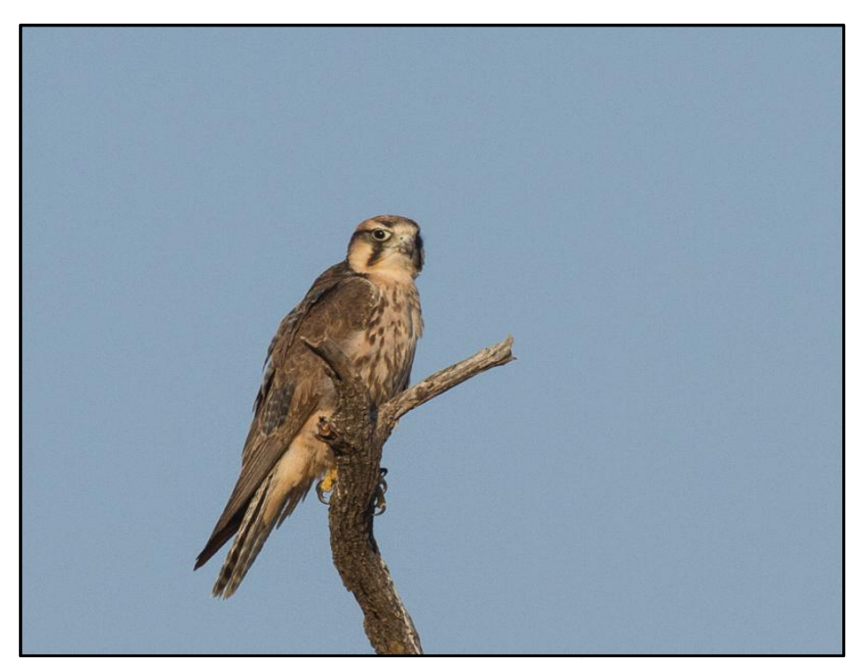
Fig 1 – An immature Lanner Falcon photographed in Botswana

This Lanner Falcon was sighted at close range (< 20 m) at 18:20 on on 23 August 2014, shortly after local sunset, leaving a perch near the clifftop at Mbomole Hill, a well-known lookout point over the Emau Valley forests of Amani Nature Reserve. I judged it to be an immature female on account of its large size, grey-brown rather than