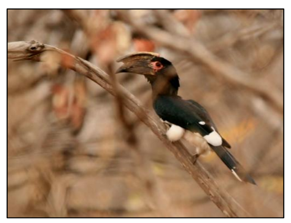
Fig 2 – A Trumpeter Hornbill photographed in Zimbabwe.

Suddenly I heard a loud pealing squawk, and turned to see a puff of feathers floating out from a point just unseen below the Mbomole Hill clifftop. Four Silvery-cheeked Hornbills fanned out from near this point, one squawking loudly, and dipped into nearby trees within about 20 seconds. The Lanner Falcon then appeared, flying away from the cliff in heavy, laboured flight, carrying a large black bundle with drooping wing and lolling head, briefly showing a glimpse of pinkish-cream casque before the bird dipped out of sight again. The cliff is sheer and the clifftop edge unstable, and as it was fast getting