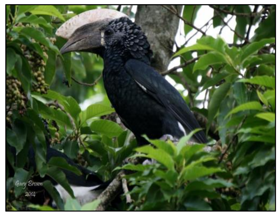
Fig 3 – A Silvery-cheeked Hornbill photographed in Malawi. © Gary Brown and Allen Dermot <a href="http://vmus.adu.org.za/?vm=BirdPix-6898">http://vmus.adu.org.za/?vm=BirdPix-6898</a>

Suddenly I heard a loud pealing squawk, and turned to see a puff of feathers floating out from a point just unseen below the Mbomole Hill clifftop. Four Silvery-cheeked Hornbills fanned out from near this point, one squawking loudly, and dipped into nearby trees within about 20 seconds. The Lanner Falcon then appeared, flying away from the cliff in heavy, laboured flight, carrying a large black bundle with drooping wing and lolling head, briefly showing a glimpse of pinkish-cream casque before the bird dipped out of sight again. The cliff is sheer and the clifftop edge unstable, and as it was fast getting