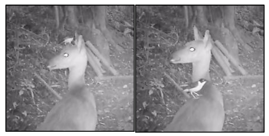
Fig 1 - Screen-shots of the film footage of a Chorister Robin-Chat visiting a Bushbuck. See footage on YouTube at <a href="http://youtu.be/D87WA5zb-9A">http://youtu.be/D87WA5zb-9A</a> (Uploaded 4 November 2014).

A review of African birds feeding in association with mammals, by Dean and MacDonald (1981), comprehensively documents a number of mammal and bird-feeding interactions. They report on the association of Brown Scrub-Robin Cercotrichas signata, Red-capped Robin-Chat Cossypha natalensis, and Chorister Robin-Chat C. dichroa feeding on insects flushed by foraging mole-rats Cryptomys spp. in KwaZulu-Natal (Oatley 1970), and the association of Redcapped Robin-Chat with Bushbuck Tragelaphus scriptus, Blue Duiker Cephalophus monticola, and cattle in forest (Oatley 1970). Terry Oatley recorded, "In the Natal midlands forest I once watched a Chorister Robin picking ticks from a Bushbuck ram" (Oatley 1959), while in Hluhluwe Game Reserve, "the Chorister Robin has been observed gleaning ectoparasites from the mane of a Nyala" (IAWM in Dean and MacDonald 1981). In addition, Skead (1997, p. 1159) notes; "Mr LG Bagshawe-Smith (pers. comm. 1978), watched one pick ticks off a Bushbuck ewe", and Vernon and Dean (1988) report on a Chorister Robin-Chat that hover-gleaned a tick from the tail of a cow on 1 August 1986 at Kambi Forest near Umtata in the former Transkei.