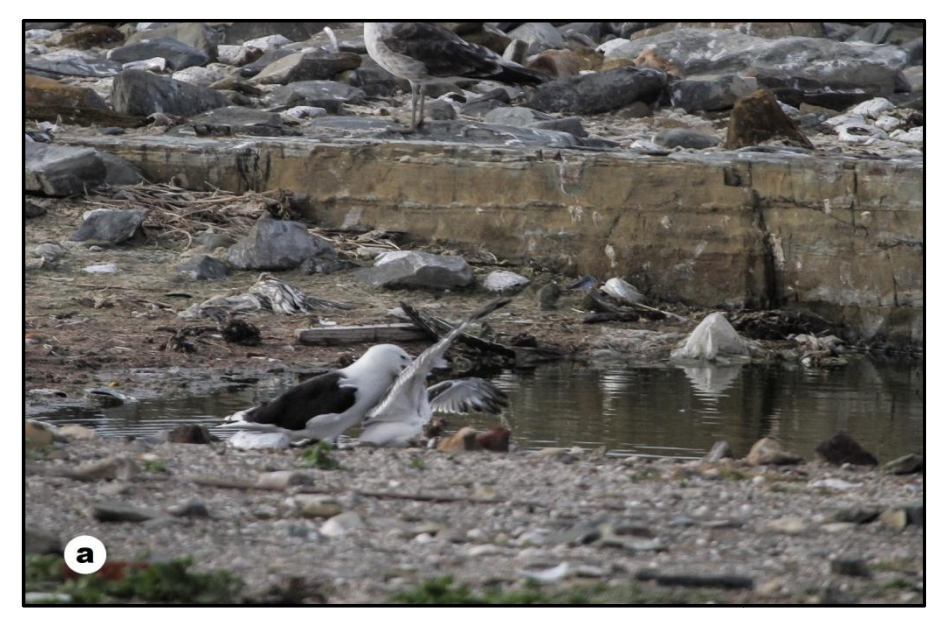
Fig 2 (above and opposite) - Video-sequences of the predation: a) Kelp Gull dragging the immature Swift Terns toward the water b) Kelp Gull forcing the head of the bird under the water c) Kelp Gull eating the interior of the dead Swift Tern.

However, predator-prey relationships at colonies are complex and vary in different systems in relation to the number and kind of predators as well as the size and age of the colony (Hunter 1991).