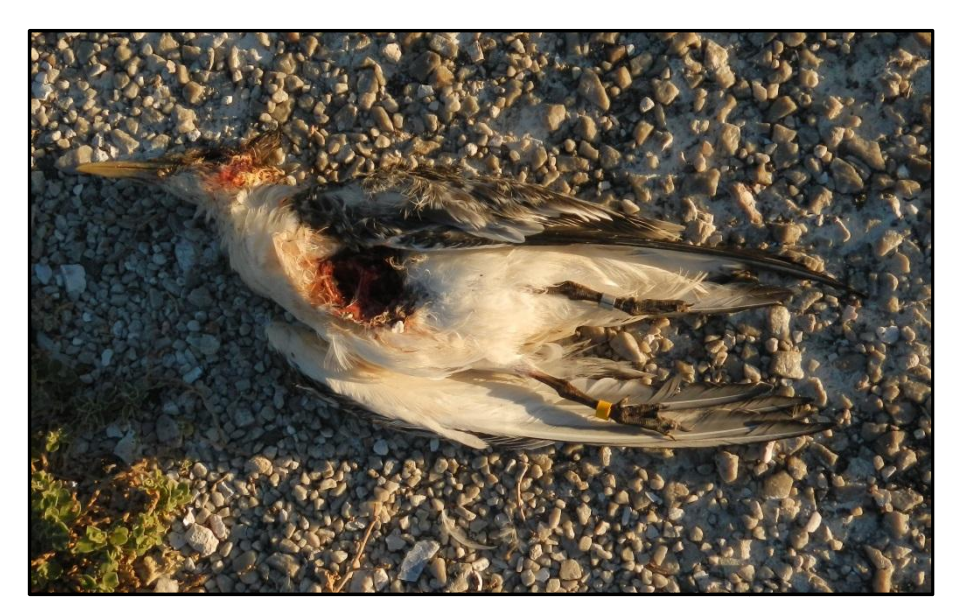
Fig 3 – The remains of Swift Terns chick after been predated by Kelp Gull.

attempting to take abandoned eggs or those of incubating birds, especially in the periphery of the colony (Fig 1).