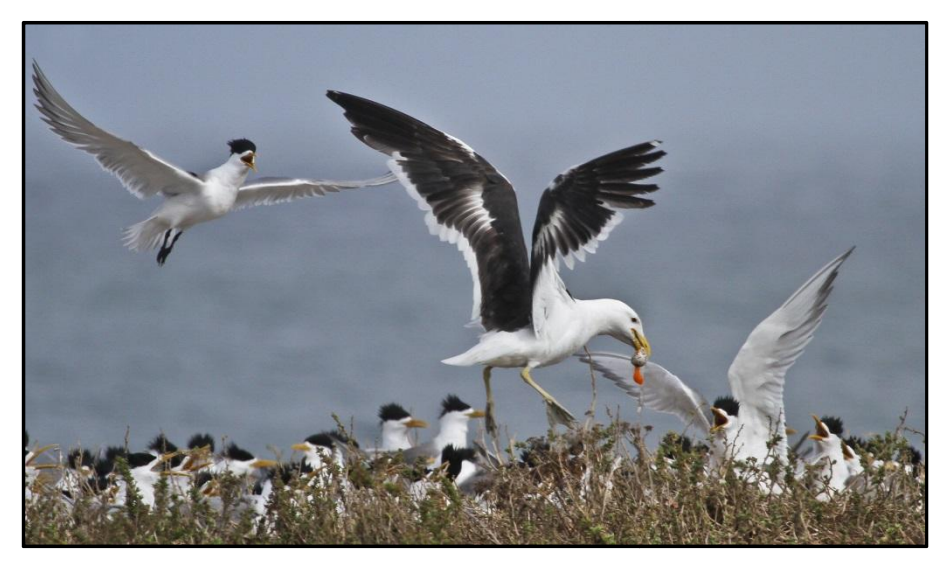
Fig 1 - Predation of a Swift Tern egg by an adult Kelp Gull

Predation by seabirds on other seabirds commonly occurs and can have a major influence on breeding success and strategies (Becker 1995, Schreiber and Kissling 2005). The Kelp Gull is versatile in its foraging behaviour and has benefited largely from human activities in coastal ecosystems (Crawford 2005). Generalist predation behaviour by Kelp Gulls is widespread in near-shore and intertidal regions and