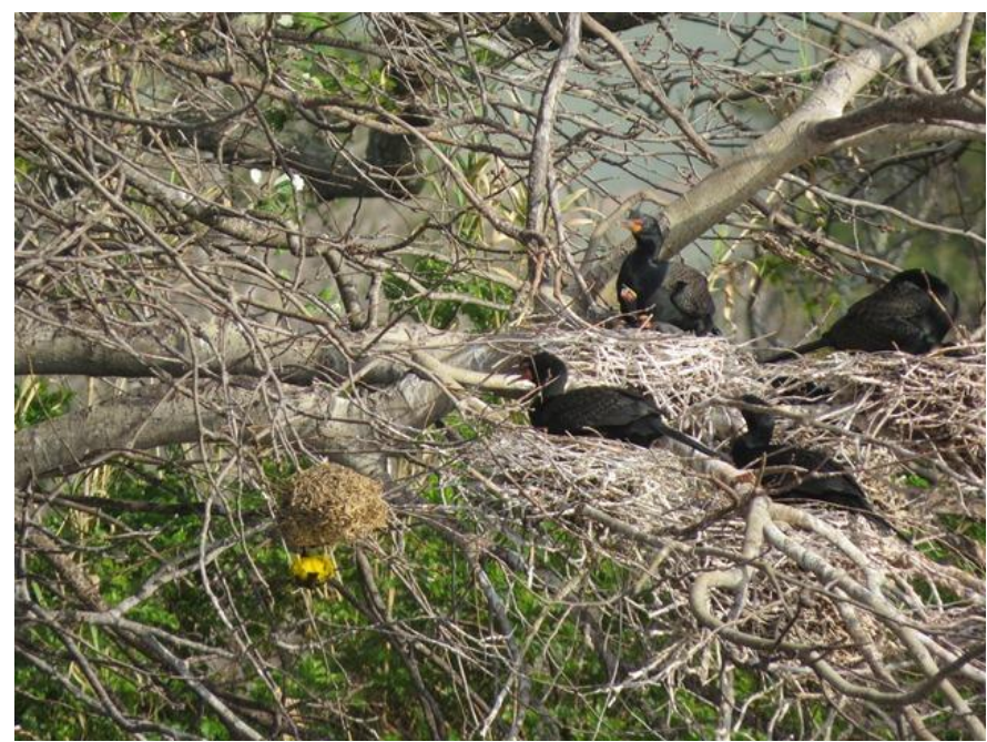
Fig. 2. Cape Weaver male at nest, near incubating Reed Cormorants at Die Oog.

The timing of breeding activity (suspected eggs and chicks) was noted for all three species. The structure of the colony was described throughout the breeding season and nest counts were conducted at every visit. Changes in the structure of the breeding colony were also investigated.