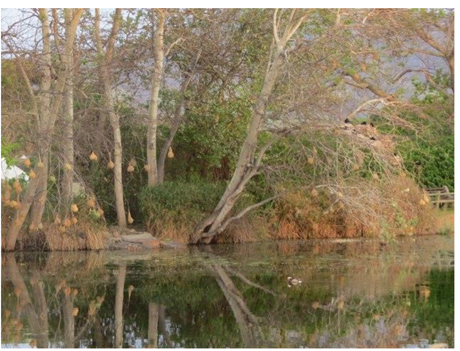
Fig. 1. Cape Weaver colony with waterbird nests at Die OogAdult Reed Cormorants are incubating on the far right.

The Cape Weaver Ploceus capensis occasionally nests in mixed-weaver species colonies (Skead 1965). This species will occasionally nest near the nests of raptors (Joubert 1932) as well as with waterbirds, such as Hadeda Ibises (Conner 1997) or in heronries (Sadler 1986; Whittington 2002 with regards to Reed Cormorants).