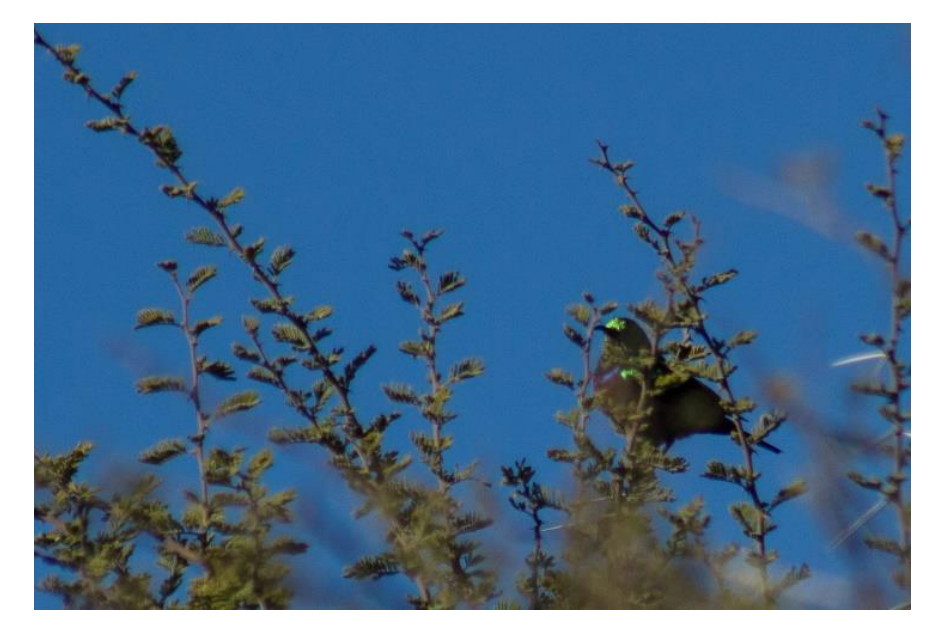
Figure 1. Male Marico Sunbird in the Alex Hall Memorial Gardens, McGregor Museum, Kimberley, on 9 August 2016

On 30 July 2016, I observed an 'all dark' sunbird in the Alex Hall Memorial Gardens (AHMG) at the McGregor Museum, Kimberley (28.748°S, 24.780°E, pentad 2840_2445). The AHMG has large patches of planted Aloe spp. and the bird was seen flitting between patches. Due to the birds' active habits and time limitations no positive identification was possible; it was most likely a Marico Sunbird based on colouration and being the only 'dark' sunbird close to Kimberley.