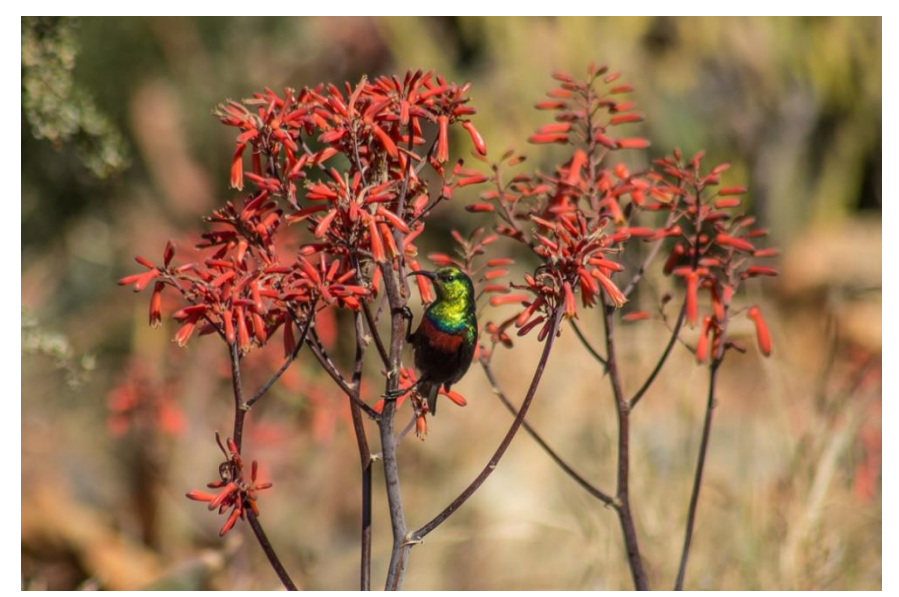
Figure 2. Male Marico Sunbird, Ria Huysamen Aloe Garden, Prieska, Northern Cape, 15 August 2016

On 15 August 2016, three males in full breeding plumage and a female were seen and photographed in the Ria Huysamen Aloe Garden (RHAG) in Prieska (N. Spangenberg and DMH) (Figure 2). These were the first known records in Prieska, and also for SABAP2 pentad 2940_2245, in which the garden is located. The record was submitted to SABAP2 and subsequent vetting confirmed the identity as Marico Sunbirds.