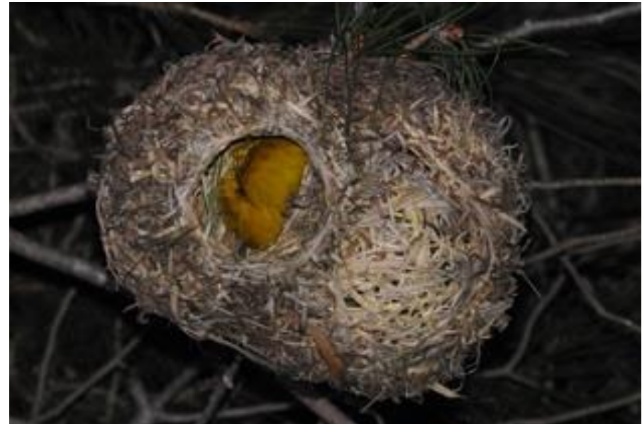
Figure 3. Cape Weaver, adult male, head tucked in (PHOWN 20165).

We monitored seven Cape Weaver colonies in Pinelands, Cape Town, on six visits at 3-4 weeks intervals in late summer, through winter, and to the start of breeding (13 March – 31 Aug 2016). The colonies were visited at night between 20h00 and 21h30. The total number of nests in each colony or sub-colony was recorded (Fig. 1). A torch was shone onto each nest and photos taken of nests where birds were seen in the nest (Fig. 2,3,5 6 & 7). Several Pinelands colonies were similar to those in Oschadleus & Werner (2015).