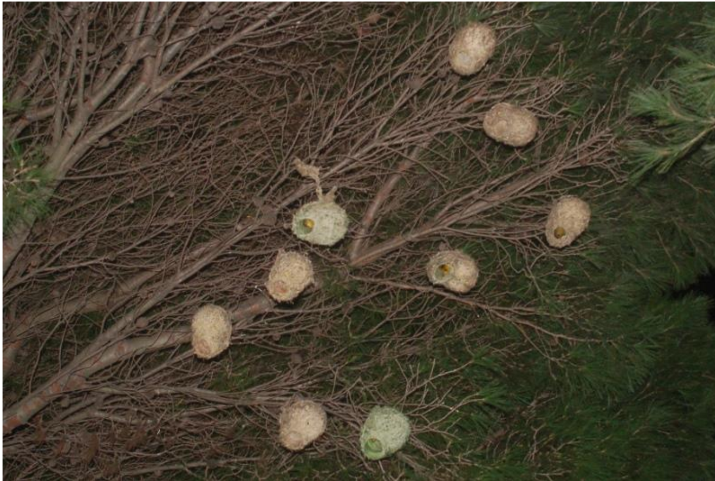
Figure 8. Colony Rust-en-Vrede Mid, Pinelands, showing several roosting Cape Weavers (PHOWN 21989).

White FN, Bartholomew GA, Howell T 1975. The thermal significance of the nest of the Sociable Weaver Philetairus socius : winter observations. Ibis 117:171-179.