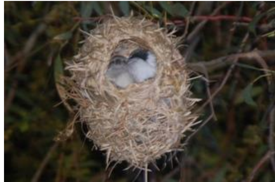
Figure 6. Cape Sparrow pair in Cape Weaver nest (PHOWN 19002).

This study does not support the thermal benefits of birds roosting in weaver nests, at least not in semi-urban Cape Town. The increase in numbers of Cape Weavers most likely reflects birds returning to their colonies in preparation for the breeding season. The decrease in Cape Sparrows roosting in weaver nests over time could be due to displacement by the increasing number of Cape Weavers, and/or due to the sparrows starting to prepare for breeding in their own nests.