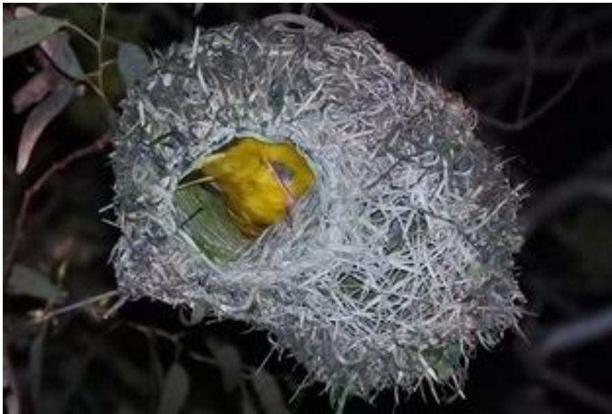
Figure 5. Cape Weaver, adult male, tail at entrance (PHOWN 23399).

In Pinelands all birds except one were seen with their heads facing the nest entrance – one weaver had the tail facing the entrance (Fig. 5). The heads were tucked back when asleep (Fig. 3,6,7) or visible when awake (Fig. 2).