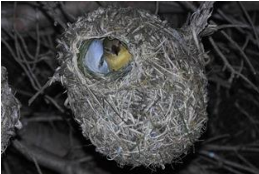
Figure 2. Cape Weaver, adult female in an old breeding nest, awake (PHOWN 23402).

Birds could choose to roost in old breeding or non-breeding nests. Old breeding nests have nest lining added and could thus provide more insulation, but could also possibly harbour more parasites.