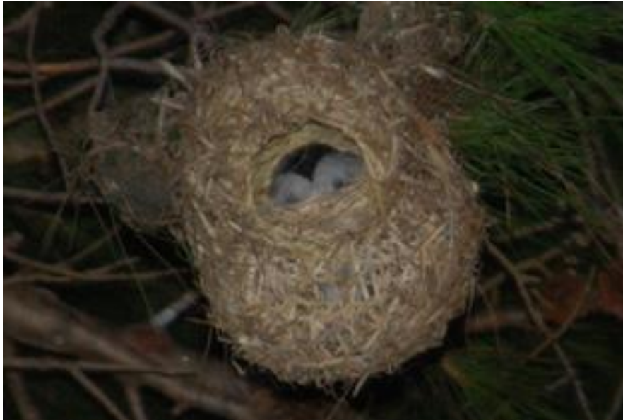
Figure 7. Cape Sparrow, adult male, head tucked in (PHOWN 19005).

The Southern Masked Weaver nests that could be observed in Rondebosch did not have any Cape Sparrows roosting in them. Cape Sparrows prefer Cape Weaver nests for breeding, and this may influence roosting choices (Oschadleus & McCarthy 2015), although it should be expected that Cape Sparrows may roost in the nests of other weavers occasionally.