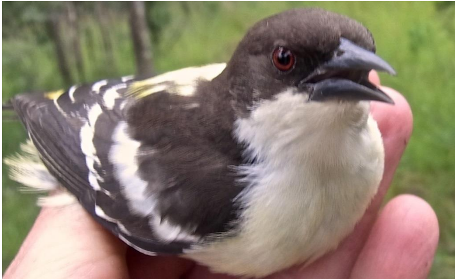
Figure 15 - Bar-winged Weaver Ploceus angolensis