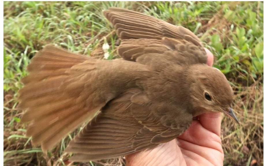
Figure 19 - Thrush Nightingale Luscinia luscinia