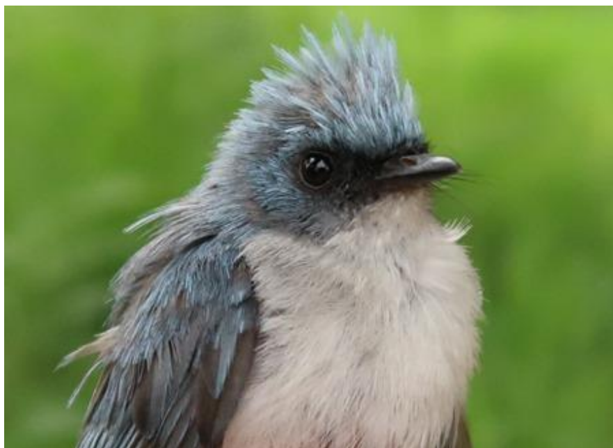
Figure 10 - White-tailed Blue Flycatcher Elminia albicauda