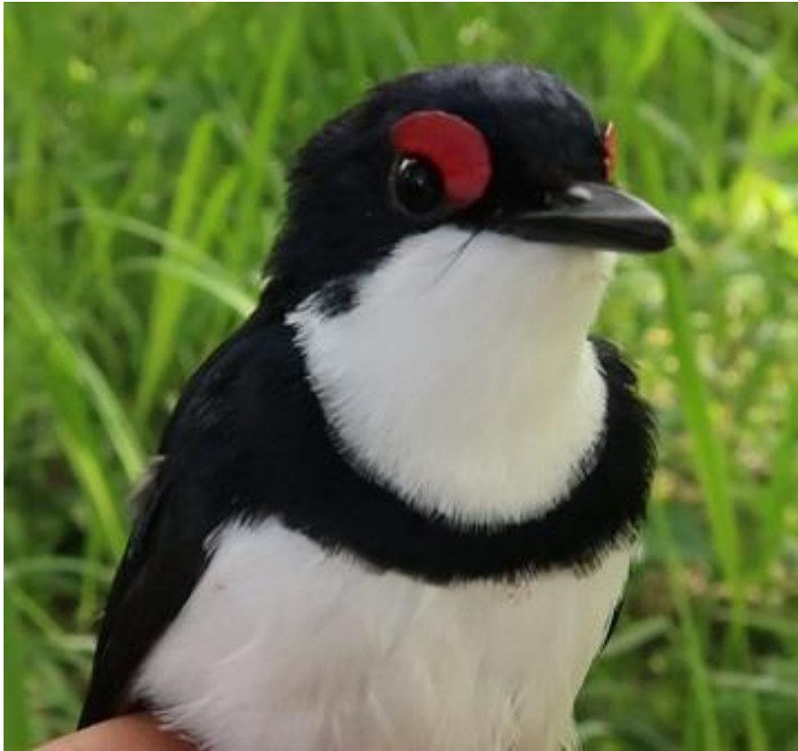
Figure 5 - Black-throated Wattle-eye Platysteira peltata

Mutinondo is a birder's paradise - chest high grass giving us Black-rumped Buttonquail, Broad-tailed Warblers and Grey-rumped Swallows. Senegal Coucals skulking along small streams of crystal water meandering through the marshy so-called dambos in the openings between pristine miombo forest, home of the Bar-winged Weaver and Anchieta's Barbet.