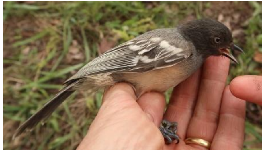
Figure 4 – Rufous-bellied Tit Parus rufiventris

Our hosts welcomed us with wonderful food and gracious accommodations. Our spacious, organically-grown-out-of-the-rock, grass-roofed chalet, one of four, offered us peaceful stillness and rest and captivating views. Small streams invited us for a bath after the day's work, with no hippos, no crocs, no bilharzia, the Hamerkop nesting above, and Finfoot paddling silently. From the well cared for campsites we could see in the valley flocks of Eurasian Hobbies hunting dragonflies.