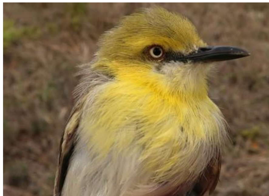
Figure 12 - Green-capped Eremomela Eremomela scotops