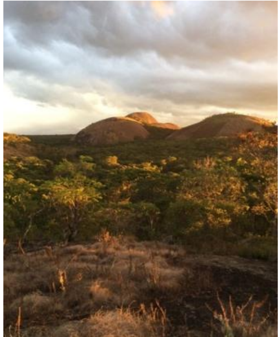
Figure 1 - View from the cabin.

The land is pristine miombo woodland with giant whale-back rocks and dambos that drain their waters through evergreen forest patches. The island mountains and vistas unfolded a sense of earth before humanity, of a timelessness before we had names. This purity and variety of habitats hosts a huge number of bird species, 356 have been recorded by now. For us, mainly ringing birds in the Namibian desert, it looked like paradise and it proved to be.