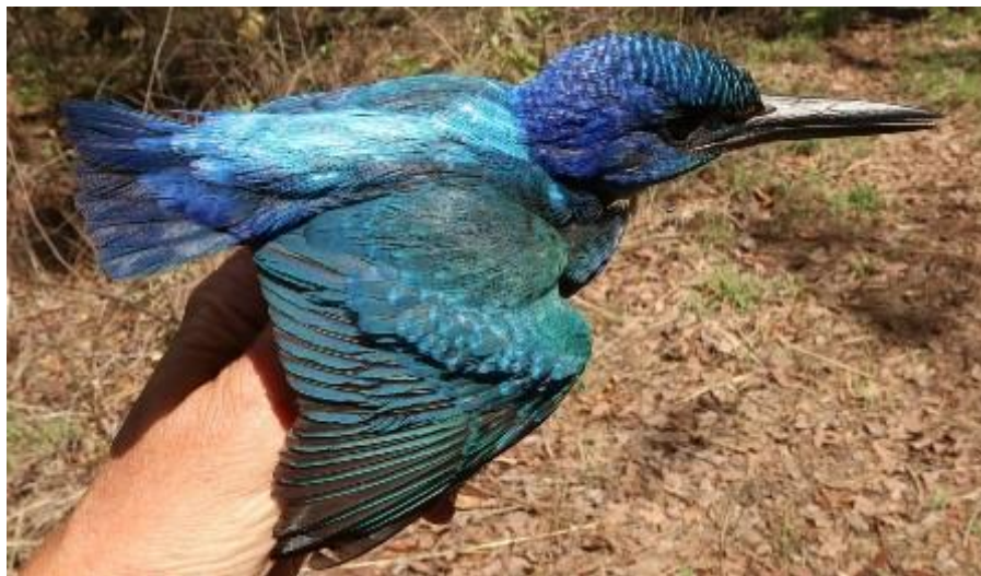
Figure 3 - Half-collared Kingfisher Alcedo semitorquata