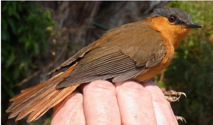
Figure 14 - Bocage's Akalat Sheppardia bocagei