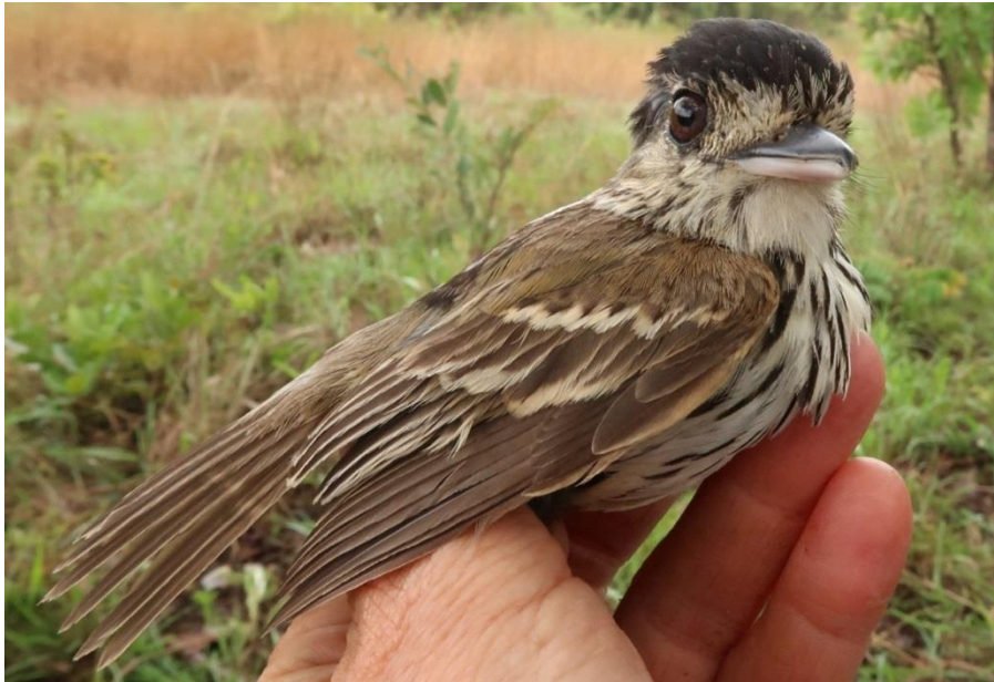
Figure 7 - African Broadbill Smithornis capensis