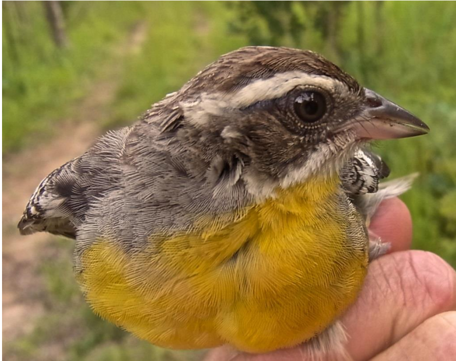
Figure 17 - Cabanis's Bunting Emberiza cabanisi

The other-worldly call of the Ground Hornbill echoing by day was matched by the Spotted Hyaena song at night. Ross's Turaco flashing through the trees on a quiet afternoon, while Schalow's Touracos were heard croaking; - we felt redeemed, reset to our initial conditions.