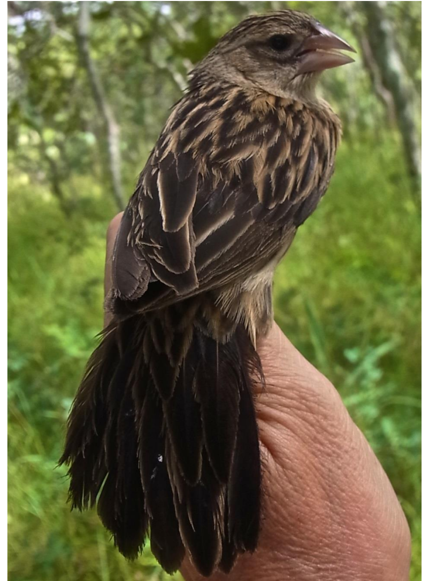
Figure 6 - Marsh Widowbird Euplectes hartlaubi

Mutinondo is a birder's paradise - chest high grass giving us Black-rumped Buttonquail, Broad-tailed Warblers and Grey-rumped Swallows. Senegal Coucals skulking along small streams of crystal water meandering through the marshy so-called dambos in the openings between pristine miombo forest, home of the Bar-winged Weaver and Anchieta's Barbet.