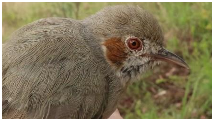
Figure 11 - Red-capped Crombec Sylvietta ruficapilla