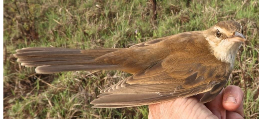
Figure 18 - Great Reed Warbler Acrocephalus arundinaceus

A special treat were the Palearctic migrants: Tree Pipits, Collared Flycatchers, Whitethroats, Garden, Marsh, Sedge and Great Reed Warblers, Thrush Nightingales and as a highlight, a River Warbler.