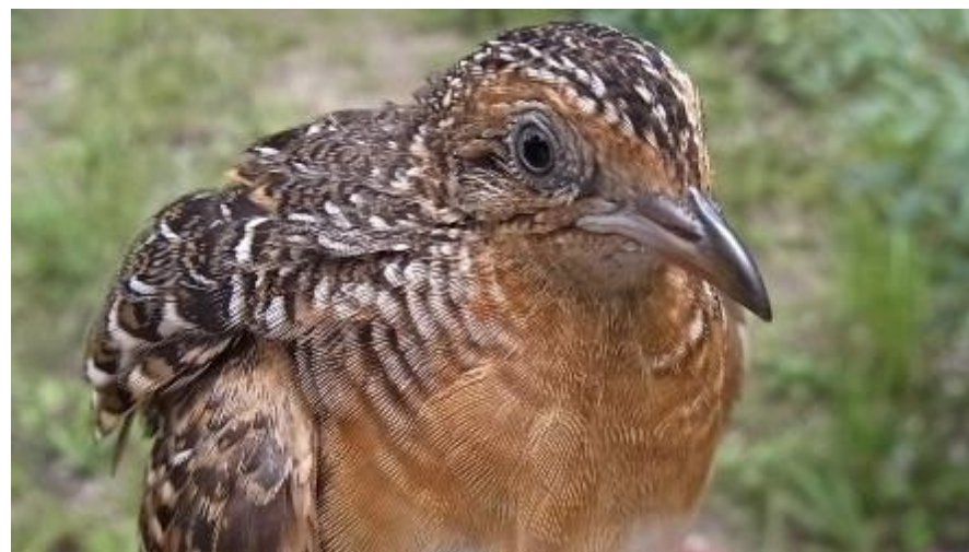
Figure 13 - Black-rumped Buttonquail Turnix nanus