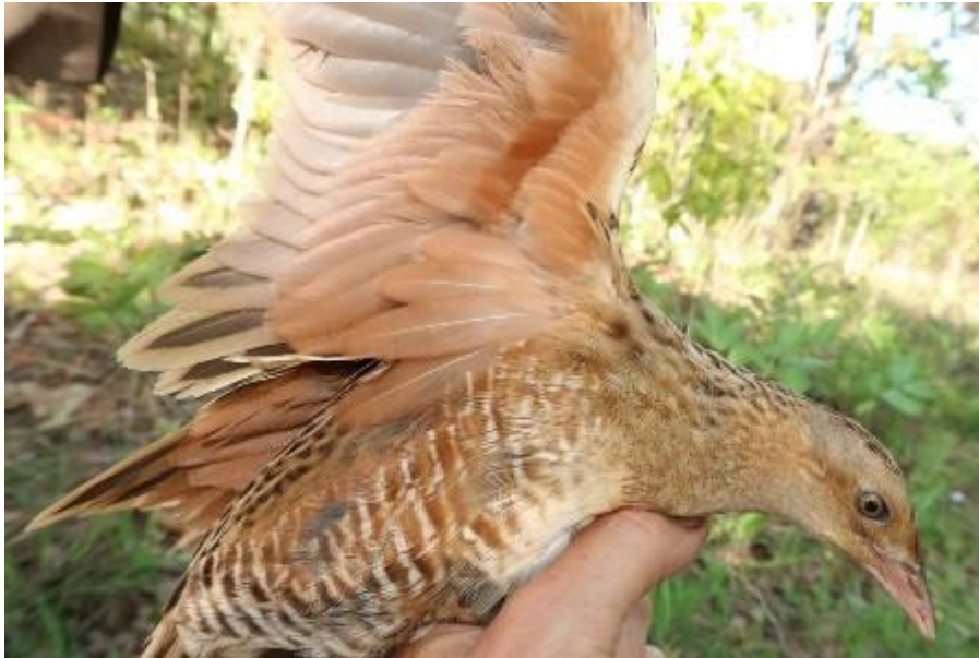
Figure 2 – Corncrake Crex crex .