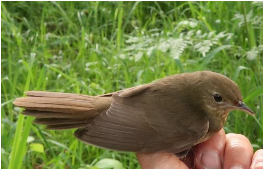
Figure 20 - River Warbler Locustella fluviatilis

We saw more than 170 species and ringed 700 birds of over 100 species.