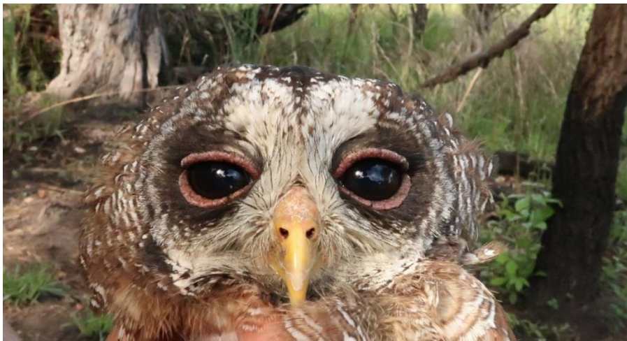
Figure 8 - African Wood-owl Strix woodfordii