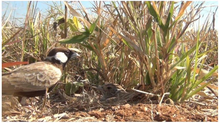
Figure 4. A pair of Grey-backed Sparrow-larks at their nest in the Limpopo River Valley. Noordgrens Estate, Weipe, June 2017.