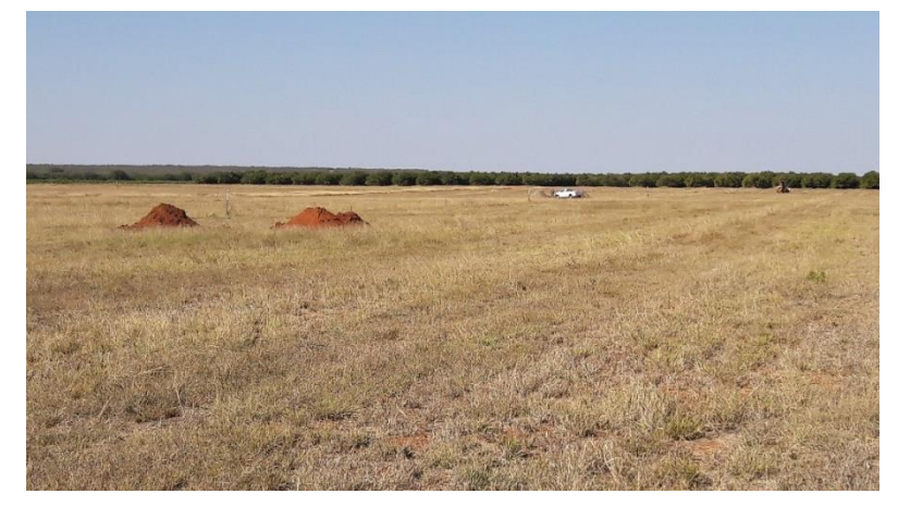
Figure 1. The open field at the Noordgrens Estate where Greybacked Sparrow-larks were breeding.

carrying nesting material. I located the nest which was still under construction but, unfortunately, I had to leave. I did not consider nest construction as unequivocal evidence of an extension of its breeding range and decided to return a week later to confirm if this pair, or any others, were breeding at the site.