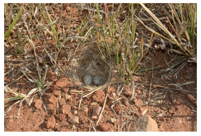
Figure 2. Grey-backed Sparrow-lark nest at Noordgrens Estate near Weipe, Limpopo Province, South Africa. June 2017.

Noordgrens Estate, there are no breeding records from this area. Brewster (2004) regarded the species as a rare winter visitor to the Bobirwa area (which includes parts of the GMTCA) in eastern Botswana. A little further west of the Bobirwa area, Brewster (1993) recorded several influxes of GBSLs into the Tswapong area in the early 1990's. It is worth noting that although Brewster (1993) often observed GBSLs in pairs during these influxes, no breeding was reported. The closest published breeding records to the Noordgrens Estate is Brewster's (1996) records from south of the Sefhare Hills area (~27°30'E) in the Tswapong South region of eastern Botswana. These records are about 250 km south-west of Noordgrens Estate and represent a 2° of longitude easterly extension of the known breeding range of GBSLs.