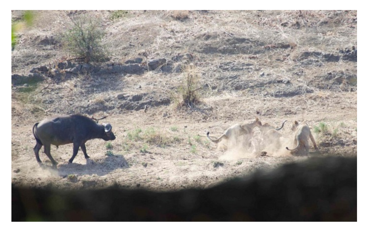
Figure 10: Second charge by buffalo.