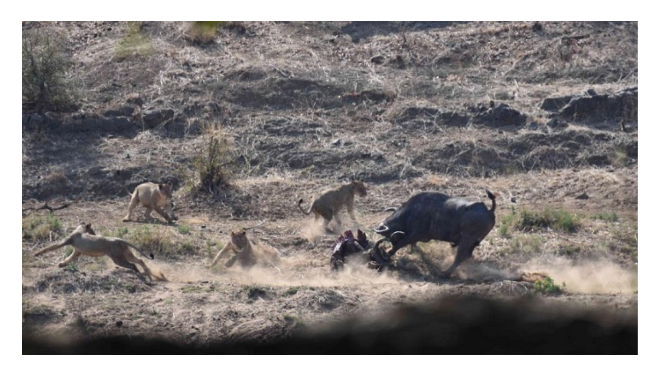
Figure 3: Buffalo thrashing the kudu carcass.