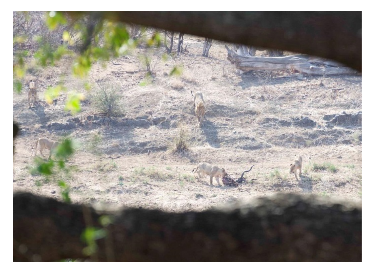
Figure 8: Lions coming back after the buffalo moved off.