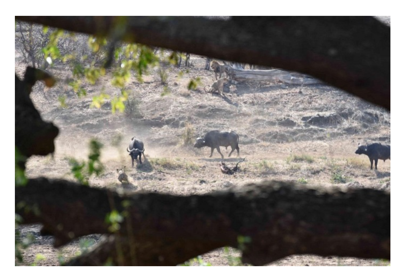
Figure 7: Buffalo "controlling" the area once the lions left.