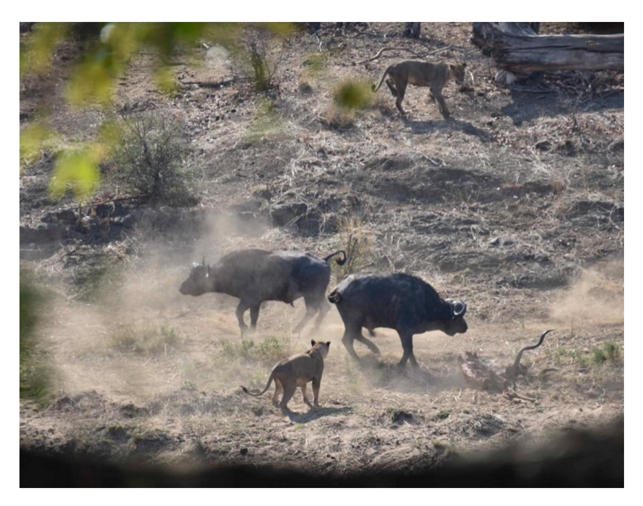
Figure 6: Buffalo "controlling" the area once the lions left.