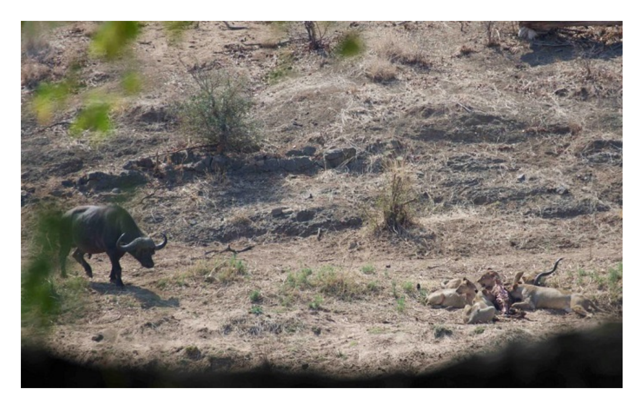
Figure 9: Second charge by buffalo.