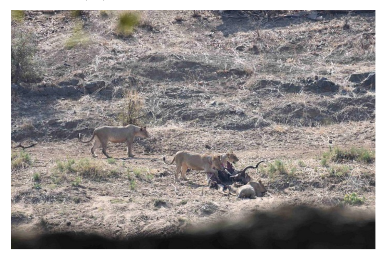
Figure 1: Four lionesses feeding on the kudu carcass.

We were on a game drive following the Shingwedzi River towards the Kanniedood Dam in the Kruger National Park on 5 October 2017. About four km after leaving the Shingwedzi Rest Camp we spotted a group of lions feeding on a greater kudu that appeared to have been killed earlier that morning (Figure 1). It was 08h30.