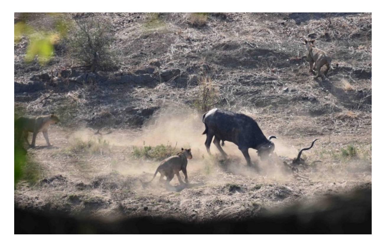
Figure 5: Buffalo thrashing the kudu carcass.

We believe that there are three issues of interest. The first is that at no time the lions attempted to face or retaliate against the buffalo despite the size of the pride. This is probably explained either by not being hungry (as they had fed on the grater kudu) and/or being aware that the strong buffalo were a dangerous prey.