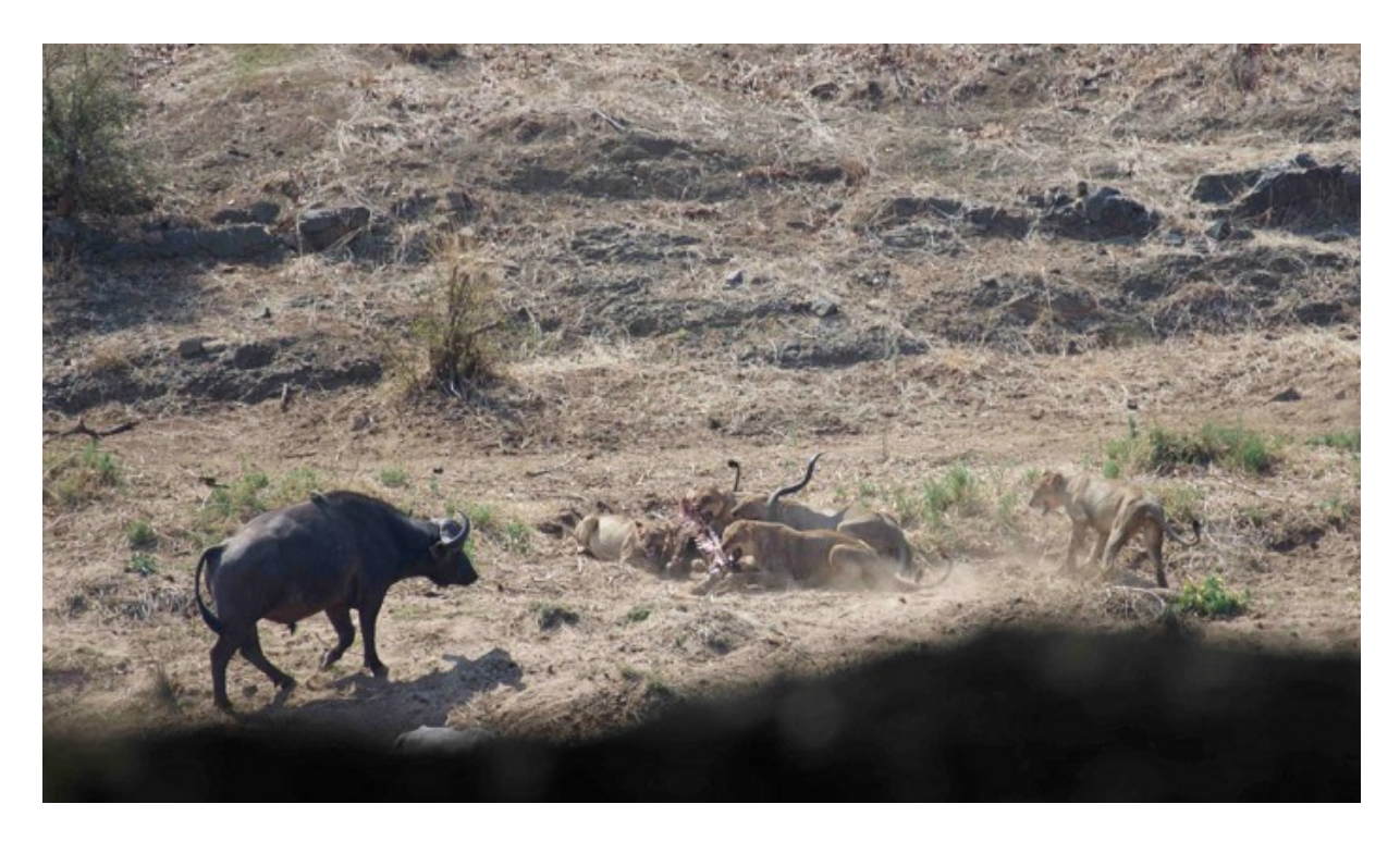
Figure 11: Second charge by buffalo.