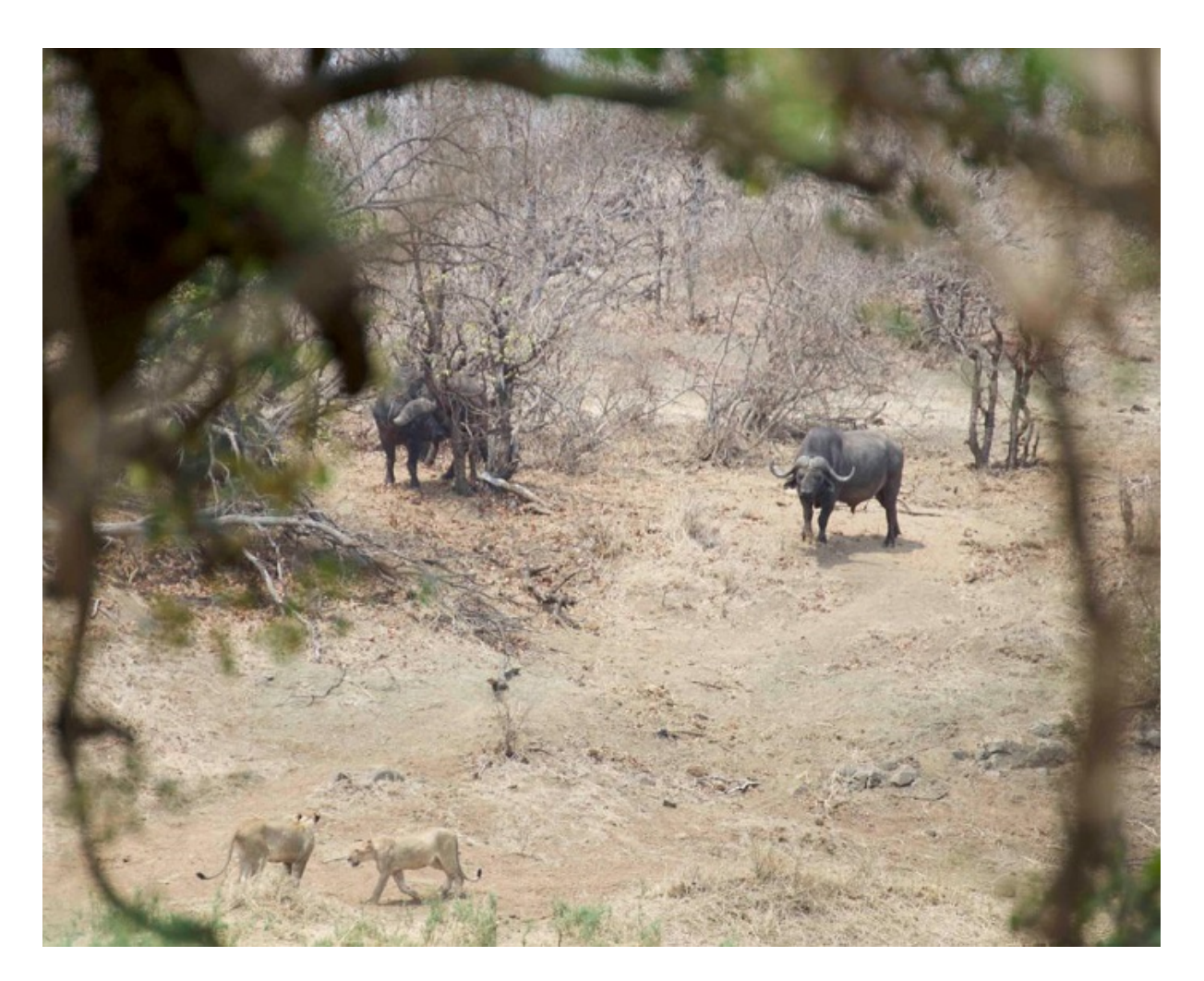
Figure 12: Buffalo pursuing lions from various places along the river. This is an example of the buffalo behaviour.