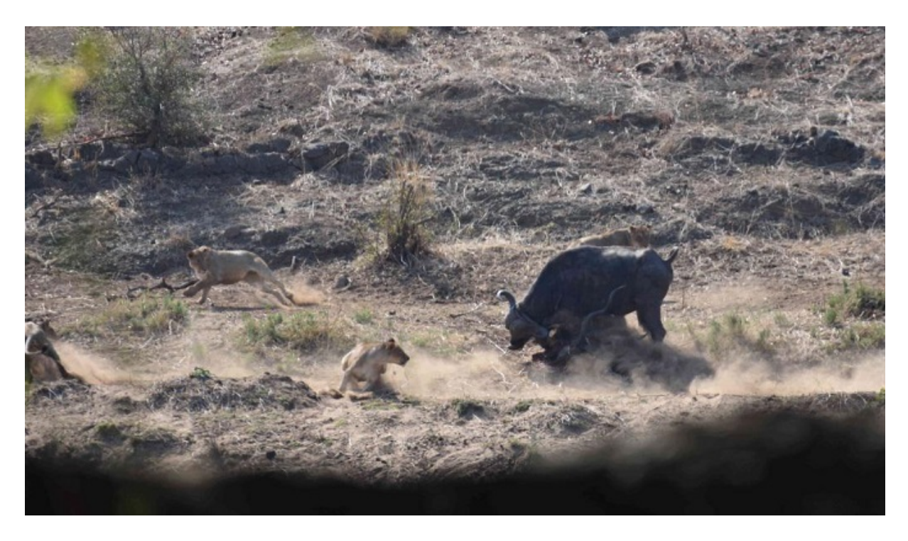
Figure 4: Buffalo thrashing the kudu carcass.