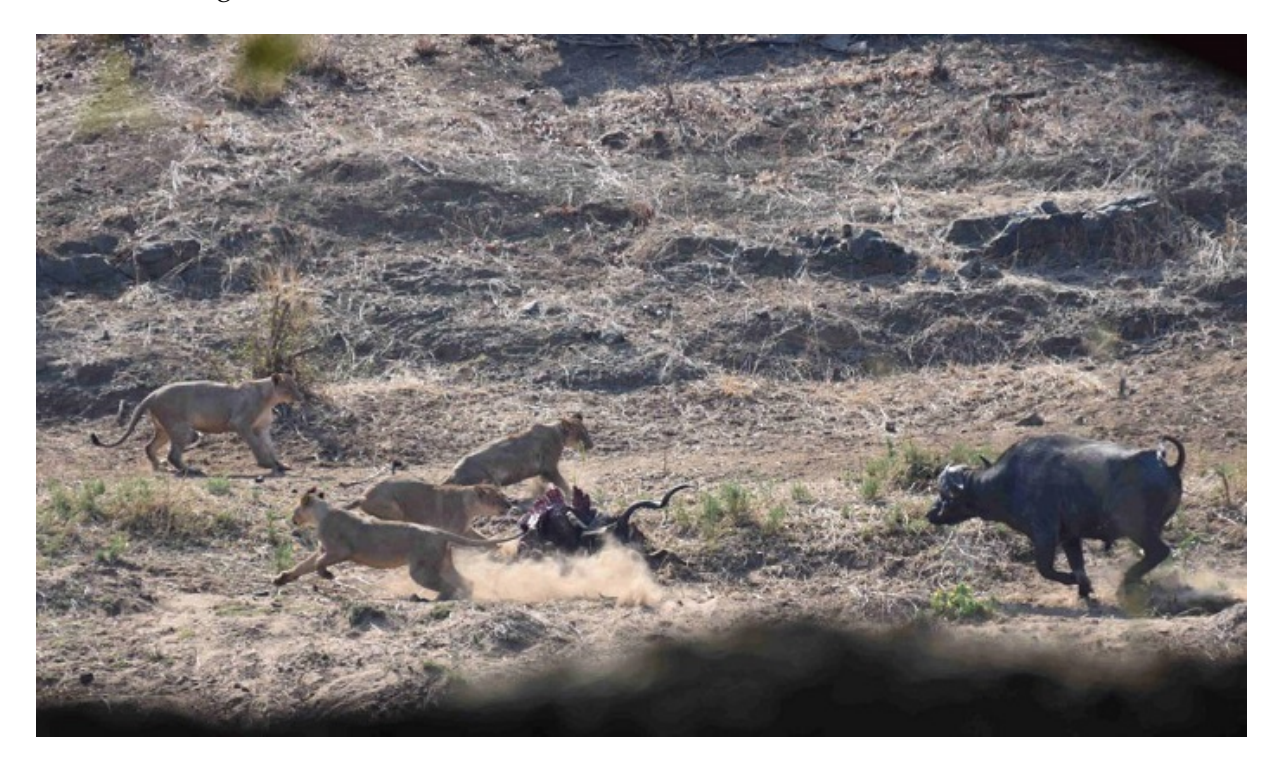
Figure 2: First charge by most aggressive buffalo.

Suddenly, one of the buffalo ran the distance that separated it from the lions at speed and charged the group, scattering them in all directions (Figure 2). Then the buffalo started to head-butt the greater kudu carcass.