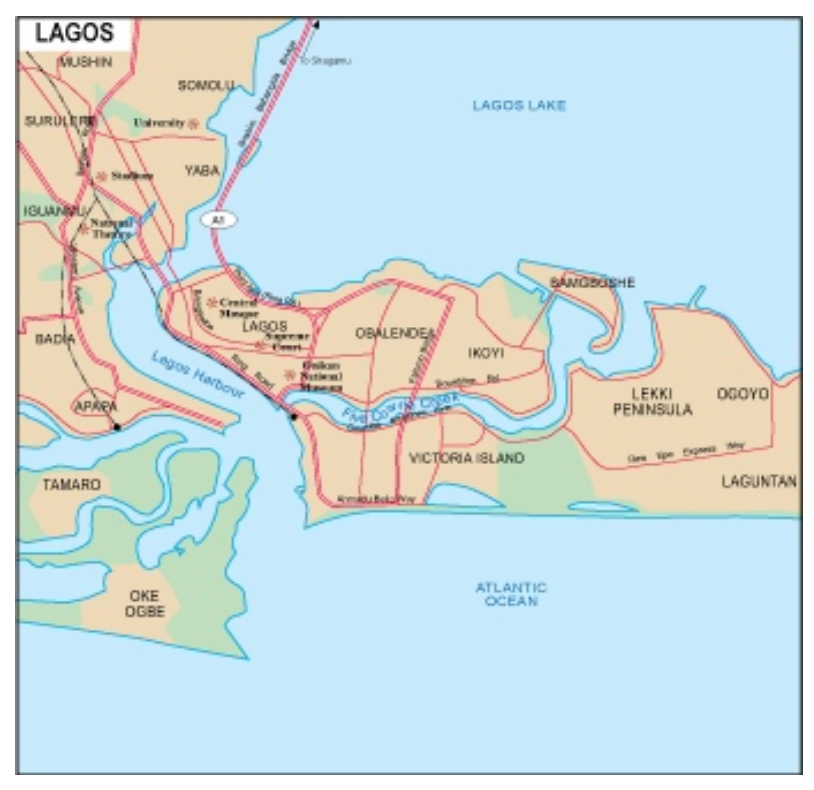
Figure 2: Map Showing Lekki Peninsula

This study is restricted to these high-end residential properties which are defined as detached or semi-detached storey buildings with outhouses and other attachments such as basements, swimming pools and guest chalets, built in a modern constructional style with high-quality materials and finishes. They are located in areas exclusively zoned for low-density residential development. This definition also includes undeveloped residential land within such areas.