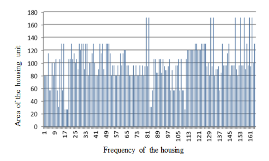
Figure 2: Area of the Housing Unit versus the Number of Housing Unit