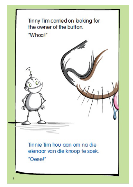
Figure 1: A page from a Nal'ibali book showing the position of the English words and their translation into the Afrikaans language (Kennedy et al. , 2016: 8).

two languages in each supplement: English and another language commonly spoken in that area of South Africa. The two languages on the page are presented with a symmetry that implies equivalent content (see Figure 1 below).