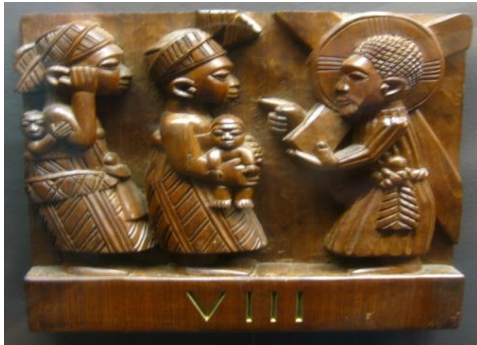
Figure 1: Stations of the Cross: Station 8 (Jesus meets the women of Jerusalem); Lamidi Fakeye.

sculptures produced in the workshop were based were entirely the priests'. Figure 1 is an example of one such depiction, portraying a biblical account.