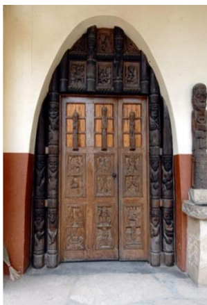
Figure 2: Carved Door of St. Mary's Church, Serima Mission, Zimbabwe; Cornelius Manguma.

The wooden sculpture here (Figure 1) represents Lamidi Fakeye's interpretation of the Stations of the Cross . Specifically presented here is his understanding and re-presentation of the Station 8 . In this rendition, according to Jones, "Christ is unmistakably African, as are the women he meets along his way to the cross". Vivid in this sculptural presentation of Station 8 are some African socio-cultural traits such as dress and child care cultures, which have been incorporated into the composition as a result of the carver's cultural affiliations.