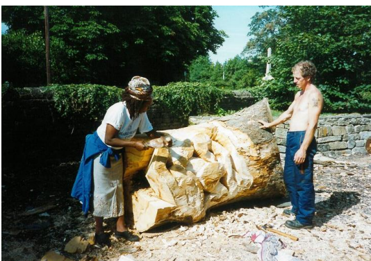
Figure 4: Artists Carving Wood Collaboratively, Pamoja 95 Workshop, UK, 1995.

Some interesting ideas are presented in Figure 4. This photograph was taken at the 1995 Pamoja Workshop in the UK. Firstly, the picture presents the type of collaborative effort put into the production of artworks at triangle model art workshops. Secondly, the idea that gender is not a barrier to participation is also encapsulated in this picture. Thirdly, the racial difference between the two figures in this composition is considered the most interesting part of this photograph.