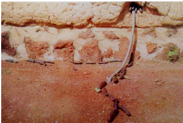
Fig. 5: Untitled Installation; Jerry Buhari, 2003. Aftershave International Workshop, Maraban-Jos, Nigeria.

Another example of the creative freedom which the triangle modelled workshops offer is observed in an untitled installation by Jerry Buhari (Figure 5). Produced at the 2003 Aftershave Workshop in Nigeria, this piece exemplifies an environment-influenced creative expression by the artist. Jerry creates a linear procession of black pods, depicting ants, filing into an opening on the wall which forms a backdrop for the composition. Jari (2003: 13) says "it was a very simple arrangement of big and black pods. He arranged them in files along the base of the building...disappearing into a hole, giving the impression as if the pods suddenly came alive like giant ants, gaining access into the room behind".