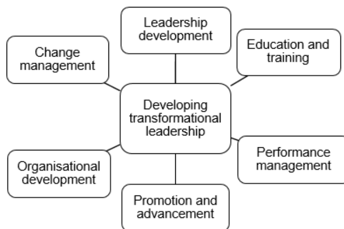
Figure 1: Developing transformational leadership practically to implement disability initiatives in the workplace.

Figure 1 focuses on the development and implementation of transformational leadership in the workplace. Before leaders can adopt any strategy or policy and be committed to the inclusion of persons with disabilities, they must adopt a transformational leadership approach. Additionally, the environment must be ready and conducive to include persons with disabilities. Although leaders have some understanding of what transformational leadership is and its importance to disability inclusion, they are not necessarily in practice applying the principles of transformational leadership to disability inclusion. Disability issues are not a priority and there are not enough resources to reasonably accommodate persons with disabilities. As this study demonstrates, transformational leaders are influential and challenge the status quo. It is these particular qualities that enable leaders to challenge the status quo and bring about change. It is contended that leaders require the aforementioned qualities in order to drive disability initiatives and effectively implement legislation governing disability in the workplace.